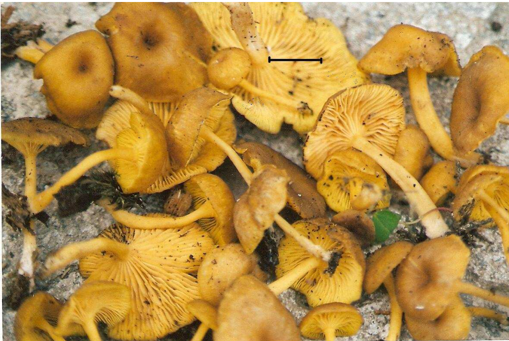
Figure 2. Chrysomphalina chrysophylla – basidiomata (bar = 2 cm); photo E. Sesli.

In the field, the surrounding vegetation and general properties of the collected specimen were noted. Photographs of basidiomata were also taken. In the laboratory, spore prints were made in order to detect the spore mass colour and the spores to be used for measurements. Microscopical examinations were made according to Breitenbach and Kränzlin (1991) by the first author. Basidiomata were dried and then partly moistened by adding a few water drops, then were sectioned. Giemsa stain was used for staining the septate hyphae and spores. The herbarium specimen was deposited in a senior author's private herbarium (SES) at Fatih Education Faculty of Karadeniz Technical University, Trabzon, Turkey.