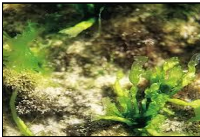
Fig. 1 Enteromorpha intestinalis (Linnaeus) Nees 1820