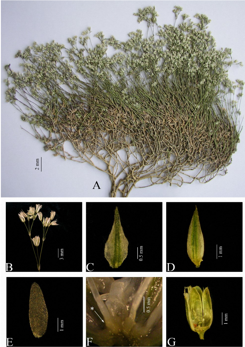
Figure 1. Minuartia setacea subsp. setacea var. setacea (Koç 2354). A– habit, B– cyme, C– bract, D– sepal, E– petal, F– (*) staminal gland, G– capsule.