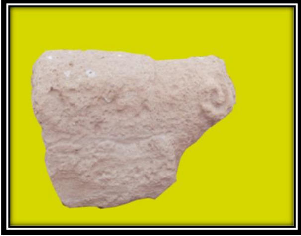
Figure 1. Number 1 ram-head tombstone

English (This is the Grave of the Deceased Kurban). It is seen that the feet of the tombstone were not carved, but the body and foot part were left as one piece. On the front of the neck, there is a depiction in low relief technique, which is estimated to be the BUĞDAYIK.