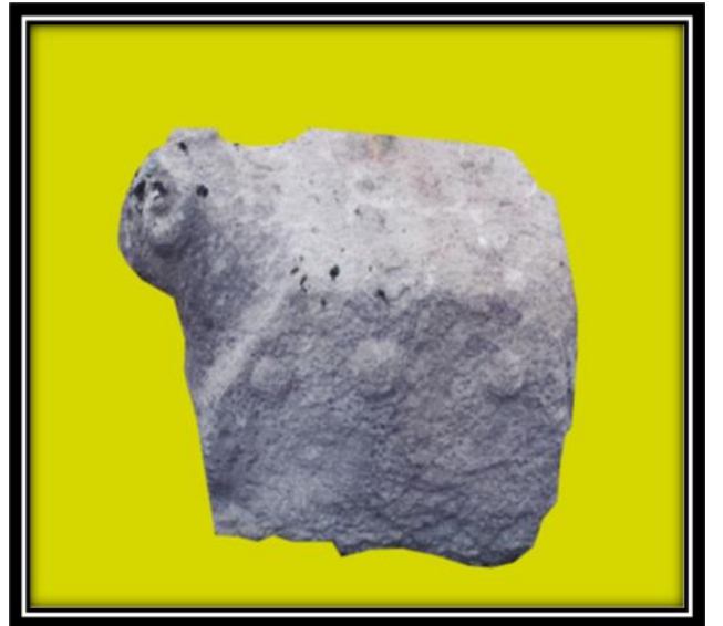
Figure 6. Number 6 ram-head tombstone