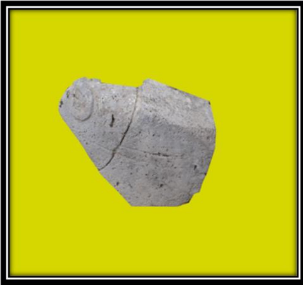
Figure 3. Number 3 ram-head tombstone