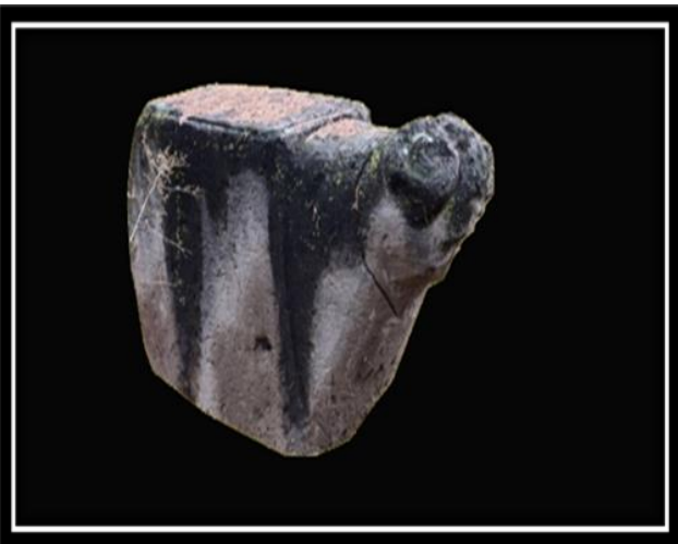
Figure 11. Number 11 ram-head tombstone