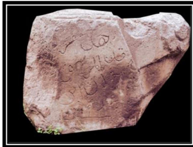
Figure 17. Number 16 ram-head tombstone