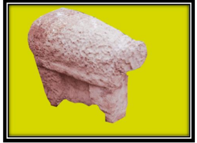
Figure 2. Number 2 ram-head tombstone