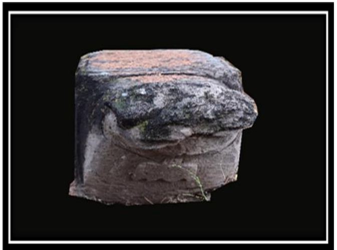
Figure 12. Number 11 ram-head tombstone