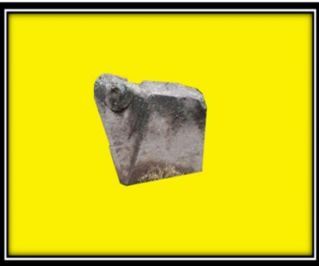
Figure 9. Number 9 ram-head tombstone