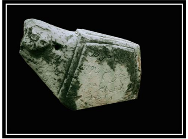
Figure 14. Number 13 ram-head tombstone