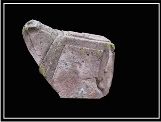
Figure 13. Number 12 ram-head tombstone