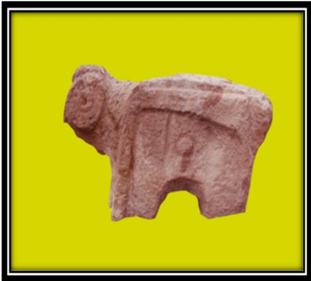
Figure 7. Number 7 ram-head tombstone