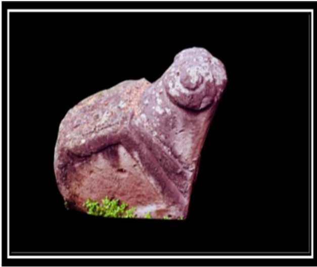
Figure 15. Number 14 ram-head tombstone