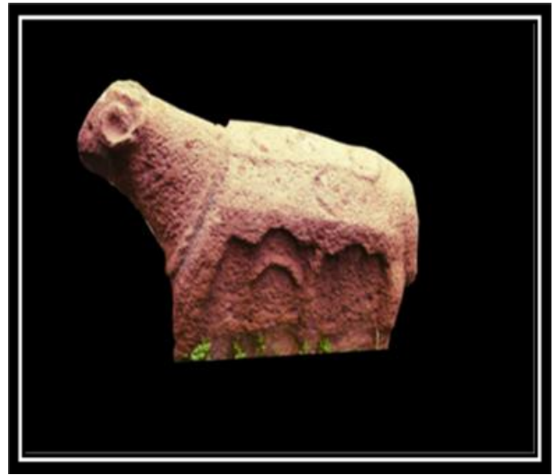
Figure 16. Number 15 ram-head tombstone