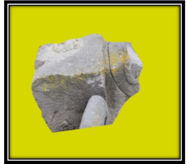
Figure 4. Number 4 ram-head tombstone