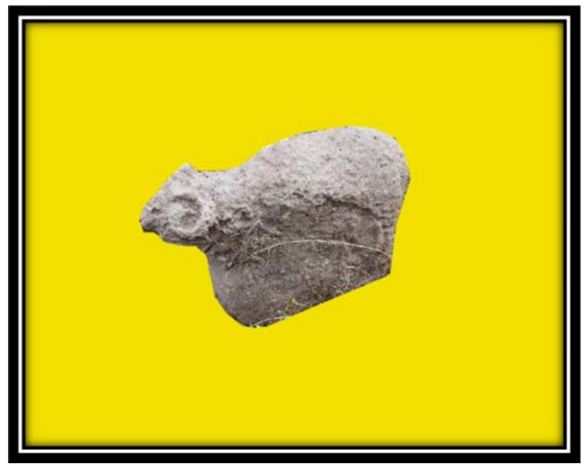
Figure 10. Number 10 ram-head tombstone