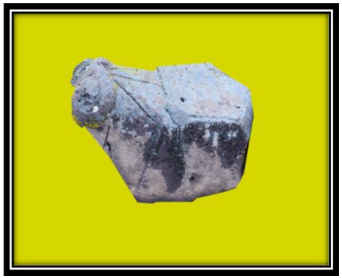
Figure 8. Number 8 ram-head tombstone