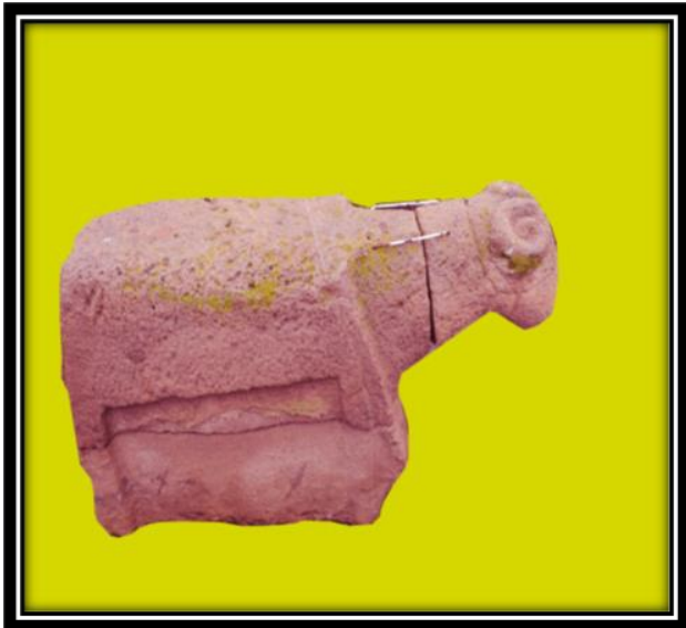
Figure 5. Number 5 ram-head tombstone