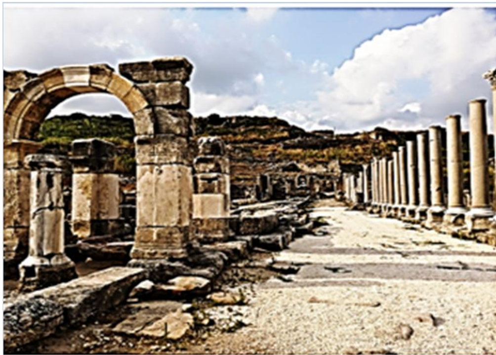
Figure 5. One example from single result-derived image (from Google Scrapping)