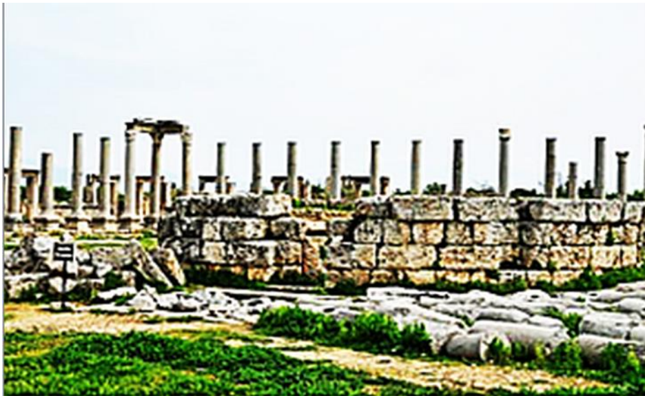
Figure 4. The items found in the Google-scraped image from Perge site

As shown in Figure 4, the service has identified the image that contains ruin, building and architectural structures. The column term reached to ca 83% probability. Therefore, ruins which are buildings that have columns and pillars, probably a temple with 70% probability, and some rocks also appeared on the images the right bottom corner. Some other results contain a single result for instance Figure 5 and the system can only be found the item ‘ruins’ without detailing the contents. The popularity of the sites has a negative effect in scrapping results since the downloaded images of Phaselis include some samples from hotels, restaurants, pensions, restaurants and any other tourism facilities, while it is rare for the Perge and Xanthos. Therefore, we can mention that the intensity of connected touristic activity effect to find the proper images. As we have this