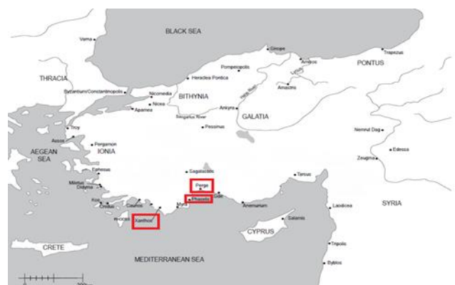
Figure 2. The location of Perge, Phaselis and Xanthos in Ancient Map [17 - 18]

The ancient city of Xanthos is located in southwest of Antalya, today's Kınık district, close to the Mediterranean shores. The city is surrounded by 2 km long walls. Archaeological excavations started in 1950 are still ongoing today. City BC It is dated to the 6th century. It came under Persian control in 546 BC, and despite this, it preserved many of its local characteristics. The most famous of these are the "column tomb". These pillar tombs are probably designed for dynasties and are pillar structures with a burial chamber, which can be decorated with carved reliefs and can weigh more than 150 tons. One of these columns carries the longest Lycian inscription, a language that has not yet been solved. Another famous tomb is the monumental tomb named as the Nereid monument and has reliefs on it [20]. This Monument is in British Museum now. Alexander the Great's conquest of Xanthos in the 4th century B.C., the city was politically completely under Greek influence. In the next centuries it presided over the Lycian federation. The city has theaters, market areas, baths, aqueducts and basilicas belonging to the Hellenistic, Roman and Byzantine periods. It is thought that the city was completely abandoned in the 12th century [20]. Also, Xanthos has been on the UNESCO World Heritage Permanent List since 1988.