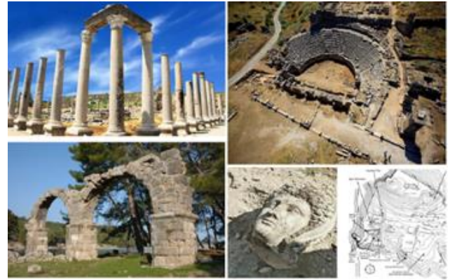
Figure 3. Some downloaded images via web-scraping for three sites (extracted by web-scraping).

Rekognition to derive the items in the web-scraped images. The following figure shows one example from the result given by the service (Figure 1).