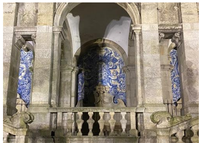
Figure 1. Porto Cathedral Façade

azulejos have become a subject of interest and research. The characteristics, production technologies, deterioration forms and restoration materials and techniques of the azulejos before the 20 th century were examined. Although manufacturing technologies of the early 20 th century have identified some industrial production techniques, degradation patterns, and major restoration techniques, current knowledge is far from complete for modern azulejos. More than 100 modern panels of azulejos have been identified in different parts of Portugal. Twelve factories are determined according to their operating periods in different regions of the country where Viúva Lamego, Constância and Sant'Anna have higher production. The composition of modern azulejos may differ from that of pre-industrial azulejos, and therefore unknown forms of decay can sometimes be observed. It is important to know the characteristics of these azulejos in order to be able to recommend appropriate restoration approaches. Identifying the most important production plants and production technologies of the 20 th century in the field of production technology is the most basic step in tracking deterioration [7].