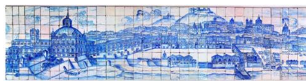
Figure 4. Grande Panorama de Lisboa, c. 1700, National Azulejo Museum