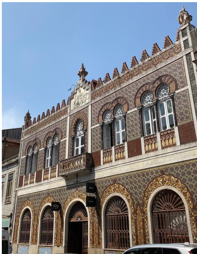
Figure 5. An exterior in Porto with Azulejos