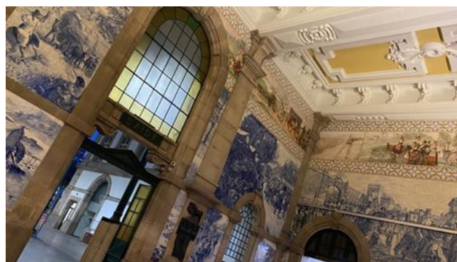
Figure 3. Sao Bento Station interior

azulejos. While two different painting styles emerged in the panels, the analytical results did not distinguish between them. Artistically, it appears that there was a demand for azulejo slips with blue ornaments on a yellow background in Portugal in the 16 th century. It is also known that the sketches of the panels are usually made on paper and the lines are punched with carbon black so that they can be transferred onto the raw glaze [10]. One of the best examples of this subject is the Grande Panorama de Lisboa, exhibited at the National Azulejo Museum (Figure 4).