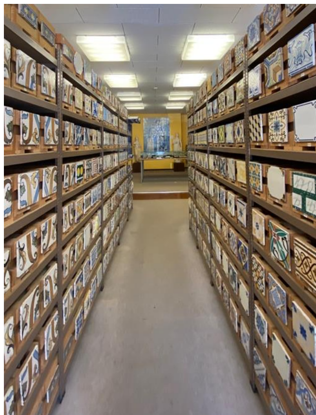
Figure 2. Bank of materials