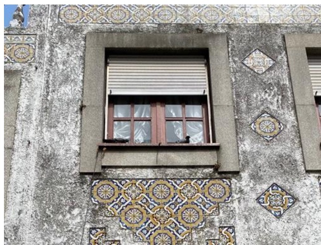
Figure 6. An exterior in Porto with Azulejos (Figure 6)

production of majolica azulejos in Portugal. With regard to the Si/Pb ratio, the composition of the glazes was largely dependent on the firing method, which was dependent on the available kiln technology. The constancy of morphological features suggests that cooking conditions did not change substantially during this period, and perhaps the oven used was always the same. When a new furnace or improved technology was introduced, possibly allowing faster firing at a higher temperature, the Si/Pb ratio was increased to save lead cost and the cycle time was shortened, which resulted in sharp interfacial crystal growths to save both time and fuel [13]. Different styles which occur by different chemical combinations and artistic reflections can be seen on facades of city (Figure 7).