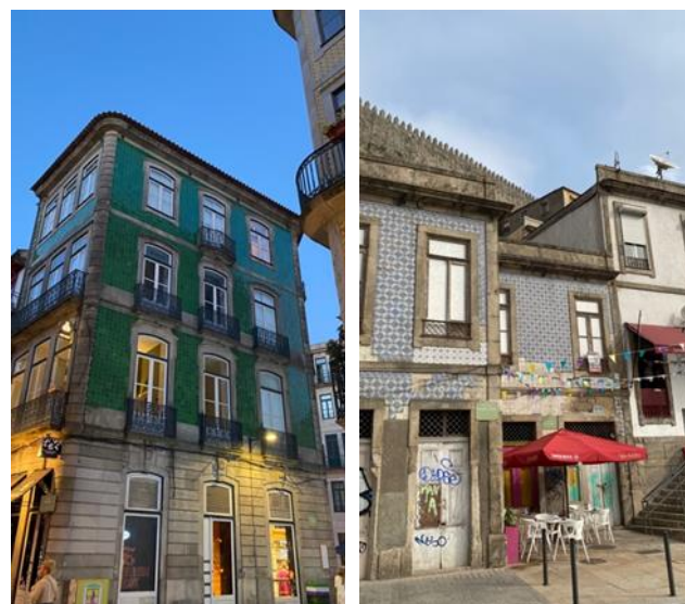
Figure 7. Two different styles of exterior in Porto with Azulejos

The addition of unusually finely ground minerals to a smalt used to paint outlines, possibly to give them body and prevent the color from flowing as they cook, can characterize a single painter or workshop. The dark lines remain protruding from the glaze with little diffusion of the blue or purple pigments into the glaze underneath [14]. The results presented here suggest that it was the collective qualities that allowed grouping the 16 th century azulejo produced in Lisbon workshops within