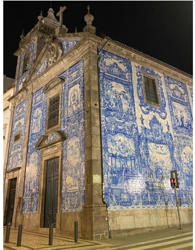
Figure 8. Chapel of Souls Facade.

to save, maintain and promote the heritage of traditional Azulejos tile work, which is facing the attack of theft, insensitivity and invalidation, is not enough, and it should be emphasized that it should be developed and expanded for similar historical legacies and façade characters [24].