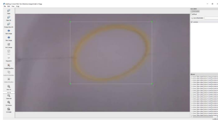
Figure 3. Tagging of data with labellmg

In order to detect an object or objects, we must first have data belonging to those classes. It is important that the data in our training kit matches the data in our test kit. Ensuring the same environmental conditions will allow the model to produce more successful results. In the similarity of ambient conditions in the trained and tested data, the model detects that object or objects with higher scores. For this reason, data collection was carried out underwater. The obtained 583 data is divided into 20% test folder and 80% train folder. The fact that the test and train data are very similar to each other causes the model to have an overfit (memorization) condition. In order to prevent this situation, attention has been paid to the diversity of data while collecting data. After data is collected, it is necessary to specify what the objects are. For this purpose, a labeling program called Labellmg was used. Labellmg produces files in xml format. The file contains the class name of the tagged object and the coordinates of the location where the object is located. Figure 3 shows the tagging of data with labellmg.