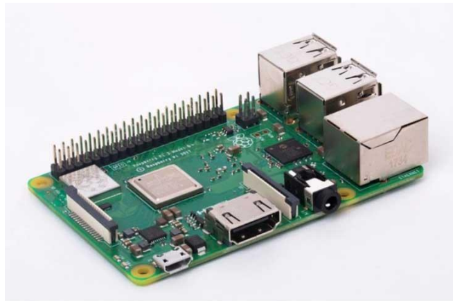
Figure 1. Raspberry Pi 3

The Raspberry Pi 3 microprocessor was used for autonomous driving in the unmanned underwater vehicle. Raspberry Pi Camera Module, which is compatible with Raspberry Pi 3, was preferred as the camera. Python is used as the software language. Figure 1 shows the raspberry Pi 3 module, Figure 2 also shows the Raspberry Pi Camera Module.