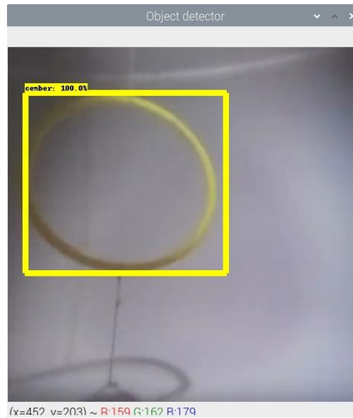
Figure 4. Detection and tracking of the circle under water with the trained model

Xml was converted to CSV, and then csv was converted to tfrecord, the format of TensorFlow. Then Labelmap is created. Then the object detection training line is configured. Finally, the training of the model was carried out. Faster-RCNN-Inception-V2 model was used as a model. However, with the Faster-RCNN-Inception-V2 model, Raspberry Pi 3 could not perform well in terms of FPS. For this reason, the SSDLite-MobileNet-V2 model is preferred, which is fast enough for most real-time object detection applications. After the training, the model was tested and successful results were obtained. Figure 4 shows the detection and tracking of the circle under water with the trained model.