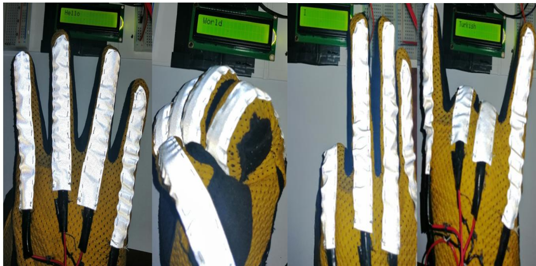
Figure 4. Test run and system output. Each word has different finger combinations.

In this study, the most used words in daily life were determined and tested. In the test study, a word was transferred to the outside via the screen for each combination made with hand and finger movements performed by the user. Figure 4 shows finger combinations of four different words (Hello, World, I, Turkish) and a screen shot in English. The logical equivalence of the combinations expressing which finger movements are determined by these words are shown in Table 1.