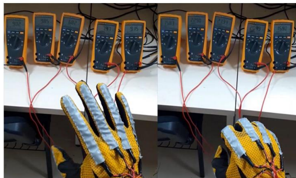
Figure 1. Testing Flex sensors. Resistance values are different during flexion and extension of hand.