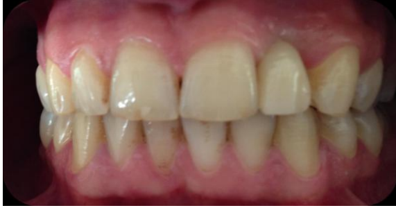
Figure 2. Post treatment.

The treatment was finished in the same month and followed up for a year.