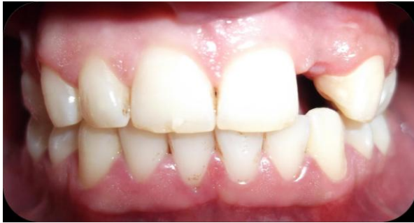
Figure 1. Pre treatment.

A 25-year old male patient who lost a maxillary left lateral tooth due to trauma admitted to the Department of Prosthodontics, Faculty of Dentistry, University of Atatürk to solve the aesthetic problems. Intraoral examination showed that there was no other missing tooth and no restoration on support teeth; the periodontal tissues were healthy and edentulous space could be used as a support for adjacent teeth. No pathological examination was observed in the respective area during radiographic examination (Figure 1).