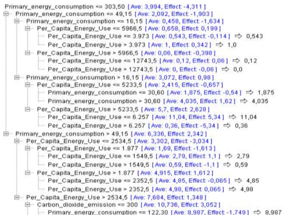
Figure 3. Rules for CR&T analysis