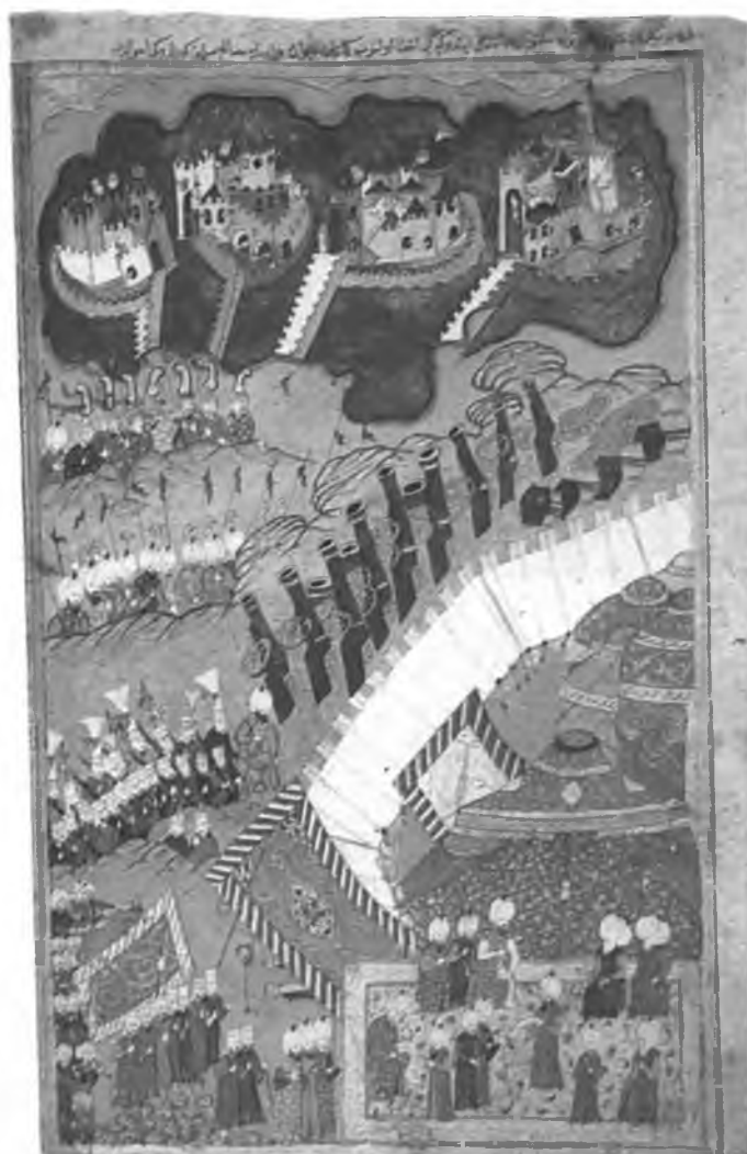
Fig. 7 The Castle Szigetvár. 1566. Miniature. Topkapı Palace. Inv. No. H. 1524. Page: 279 b.