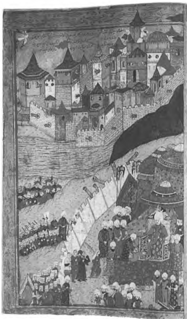
Fig. 6 – Suleyman I. in Buda Castle. 1541. Miniature. Topkapı Palace. Inv. No. H. 1524. Page: 266 a..