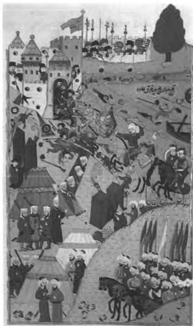
Fig. 2 – Battle of Belgrad. 1456. Miniature. Istanbul Topkapı Palace. Inv. No. 1523. Page: 165 a.