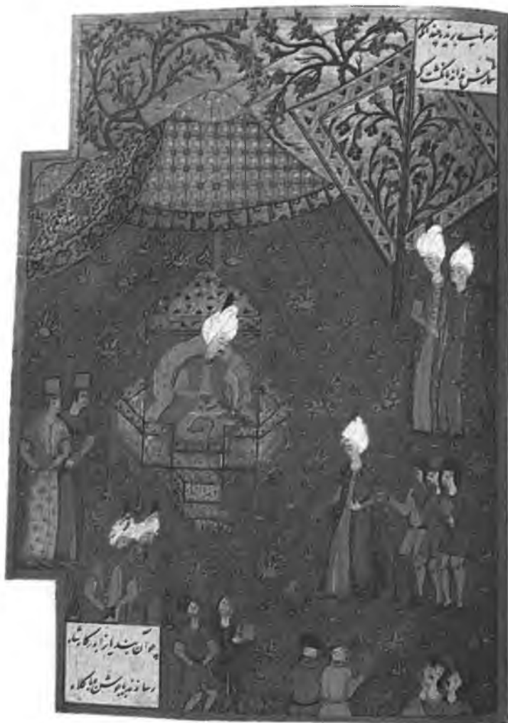
Fig. 4 – Suleyman I. 1529. Topkapı Palace. Inv. No. H. 1517. Page: 297 a.