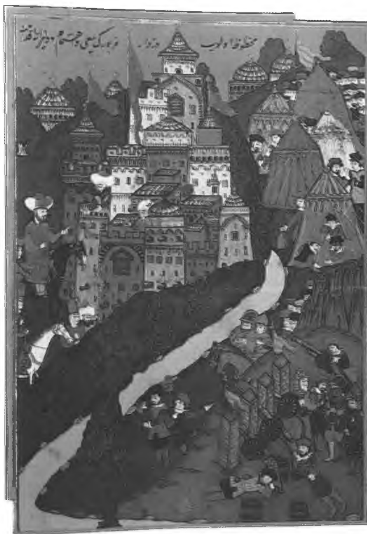
Fig. 1 – The Battle of Nicopolis. 1396. Miniature. Istanbul Topkapı Palace. Inv. No. H. 1523. Page: 108 b.