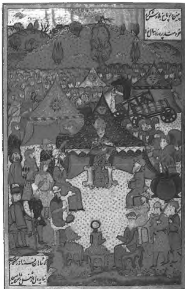
Fig. 3 – The King Lajos II. with his war-council, in 1526. Miniature. Istanbul Topkapı Palace. Inv. No. H. 1517. Page: 200 a.