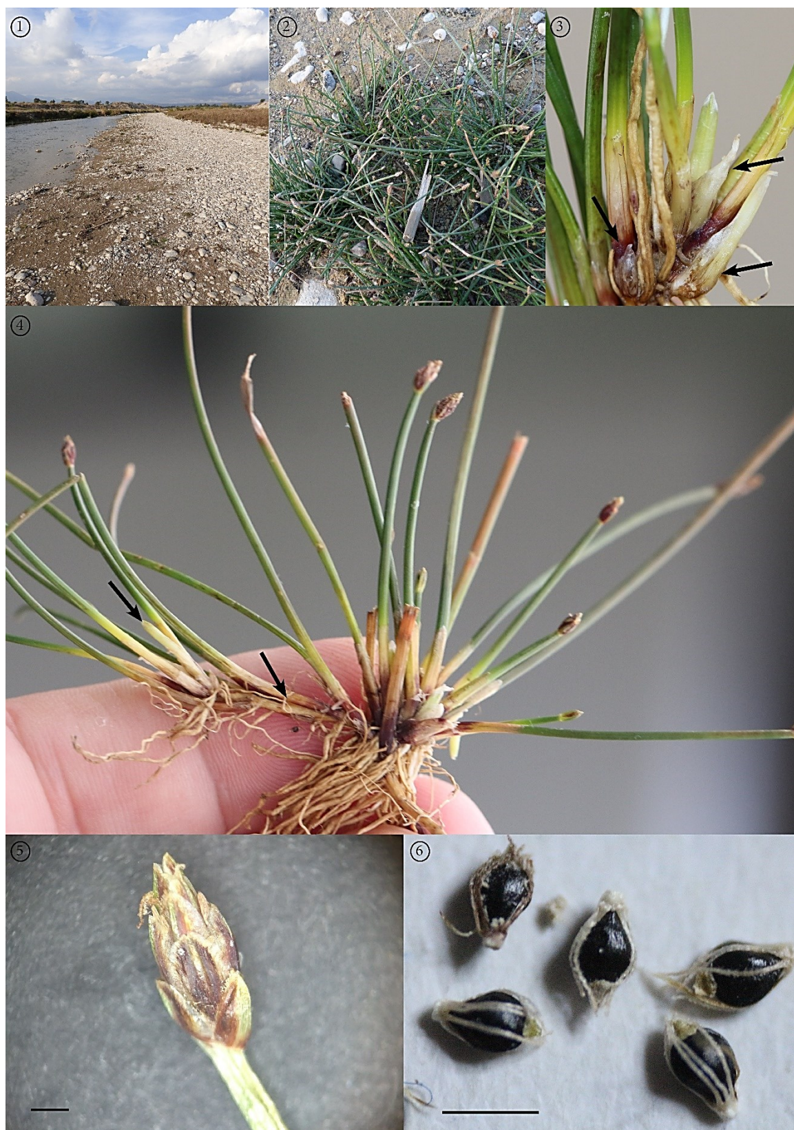
Fig. 1. Eleocharis divaricata M.Keskin sp.nov. (1) Habitus, (2) General view, (3) Close up from the base, (4) A single plant, (5) A spikelet, (6) Achenes. (The arrow indicates amphicarpic shoots, all scale bars 1 mm).

Acknowledgments: The first author would like to thank the ANG foundation for their financial contribution to the Edinburgh trip.