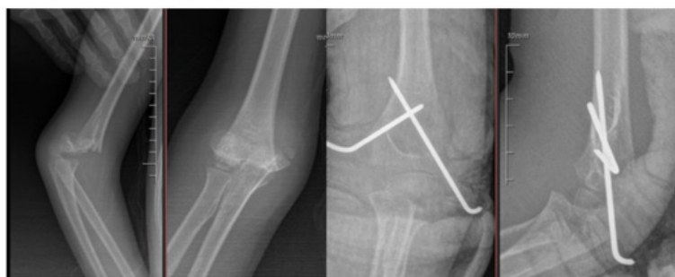
Figure 1. A case 7 years old girl, Type 3 supracondylar humerus fracture preop and postop x ray pictures.

alyzed with the Chi-Squared test and Fischer's exact test, and parametric data of the two groups were compared with the Student's t-test. Categorical data were percentage (%), number (n), and frequency while parametric data were mean, standard deviation, minimum, and maximum values. The data were analyzed at a confidence interval (CI) of 95% and a p-value less than 0.005 was considered statistically significant. ( p < 0.05 )