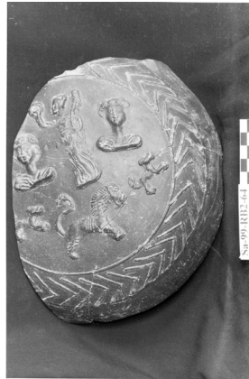
Fig. 5 Round, relief decorated flask (diameter: 0.24m) representing two busts of Dionysus, one of which is crowned by a centrally standing Nike holding a palm branch, with dogs and lion running towards the right underneath, dated to the 5 th century CE and found at the Roman Baths (inv. n° SA1999RB2-64;).