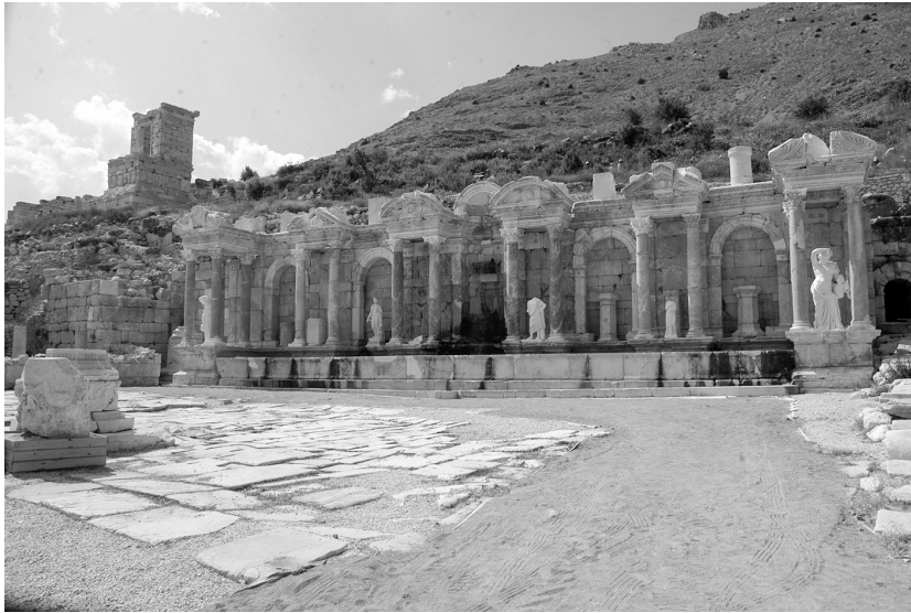
Fig. 1 The Antonine Nymphaeum dedicated to Dionysus on the north side of the Upper Agora of Sagalassos (© Sagalassos Archaeological Research Project).