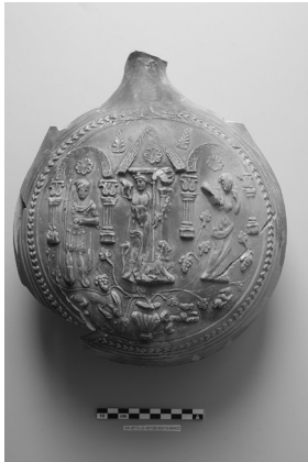
Fig. 4 Round, relief decorated flask (diameter: 0.26m) representing Dionysus standing between Ares and Aphrodite, with rabbits feeding on vines emanating from a cantharoid crater underneath, dated to the 5 th century CE and found at the potters' workshop east of the Neon Library (inv. n° SA2013LE-129-210; © Sagalassos Archaeological Research Project).