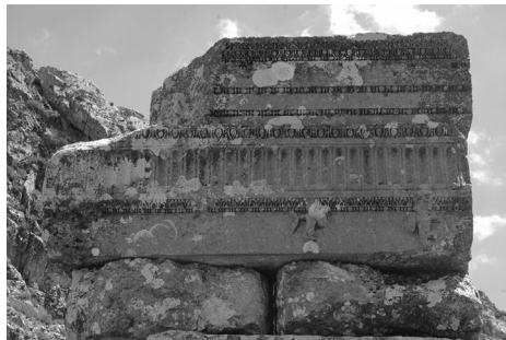
Fig. 7 Frieze of dancing satyrs, incorporated into the north wall of the polygonal apse of Basilica E1.