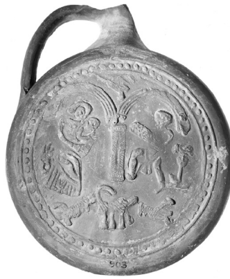
Fig. 9 Round relief decorated flask (diameter: 0.17m) with an adoratio scene set within arches and accompanied by a bust of Dionysus to the right; dated to the late 5 th century CE and originating from an unknown location in Asia Minor; kept at the British Museum (inv. n° MLA 1882.1-9.1; Hayes 1997, 88 pl. 36).