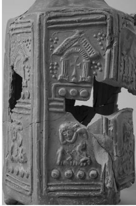
Fig. 8 Hexagonal, relief decorated flask with a stylized representation of the Eucharist, dated to the late 5 th – early 6 th century CE and found on the Lower Agora (inv. n° SA2003LA1-72).