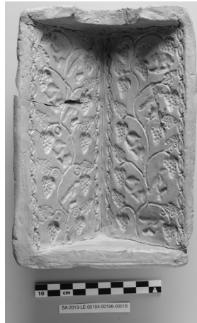
Fig. 13 Terracotta mould for a square oinophoros depicting an inhabited vine with animals feeding on grapes, dated to the 5th century CE and found at the potters' workshop east of the Neon Library (inv. n° SA2013LE-104-196; © Sagalassos Archaeological Research Project).