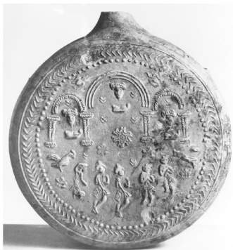
Fig. 6 Round, relief decorated flask (diameter: 0.25m) representing three busts of Dionysus set within arcades, preceded by members of the thiasos dancing to the tunes of Pan playing the syrinx, dating to the 5 th century CE and said to have been found in the Fayoum, now kept at the Museum for Egyptian Antiquities at Cairo (inv. n° JE89081; Poblome 1998, 215 pl. 1.1).