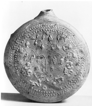
Fig. 10 Reverse of the round, relief decorated flask said to have been found in the Fayoum (see Fig. 6), depicting a vine harvesting scene and four crosses (Poblome 1998, 215 pl. 1.2).