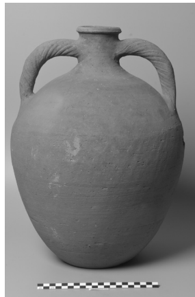
Fig. 11 Locally produced amphora, dating to the late 6 th CE century and found on the Lower Agora (inv. n° SA2000LA-117; © Sagalassos Archaeological Research Project).