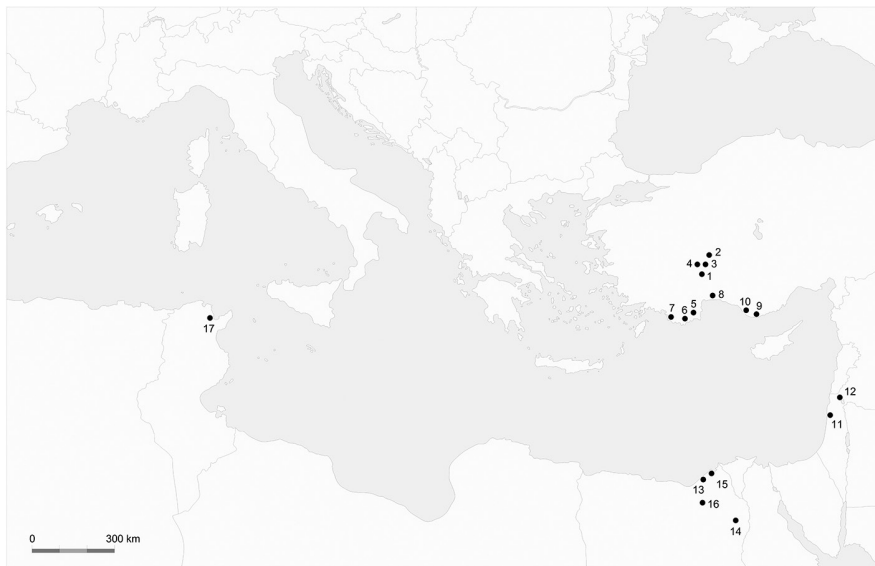
Fig. 14 Map of the Eastern Mediterranean indicating the known distribution of oinophoroi produced in Sagalassos. 1: Sagalassos, 2: Pisidian Antioch, 3: Bindaïos, 4: Seleukeia Sidera, 5: Limyra, 6: Myra, 7: Patara, 8: Perge, 9: Anemurium, 10: Selinous, 11: Caesarea Maritima, 12: Kapharnaon, 13: Alexandria, 14: Fayoum, 15: Kanopos, 16: Kellia, 17: Carthage.