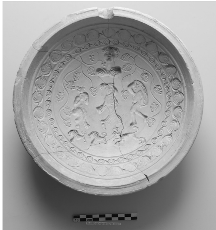
Fig. 12 Terracotta mould for a round oinophoros, depicting the thiasos with a bust of Dionysus above, dated to the 5th century CE and found at the potters' workshop east of the Neon Library (inv. n° SA2013LE-144-246).