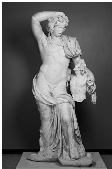
Fig. 2 Marble statue group of Dionysus and satyr from the eastern corner aedicula of the Antonine Nymphaeum (© Sagalassos Archaeological Research Project).