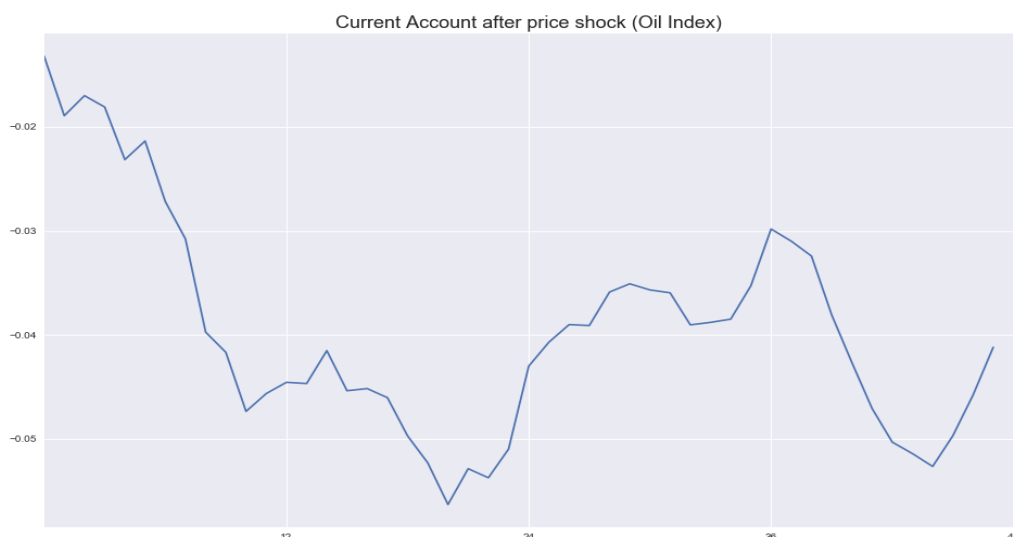
Figure 1: The Impact of One Standard Deviation Increase in International Oil Price Index on the Current Account Balance

The spread of effect size over time may be due to two factors. The first is the time lag between the spot price of petroleum and the price on the date of import (2-3 months), and the other is the time for price adjustments of imported goods, which are partly dependent on oil prices, such as natural gas. Moreover, the decrease in demand after the increase in the price of petroleum products may explain the upward movement after the 20th period.