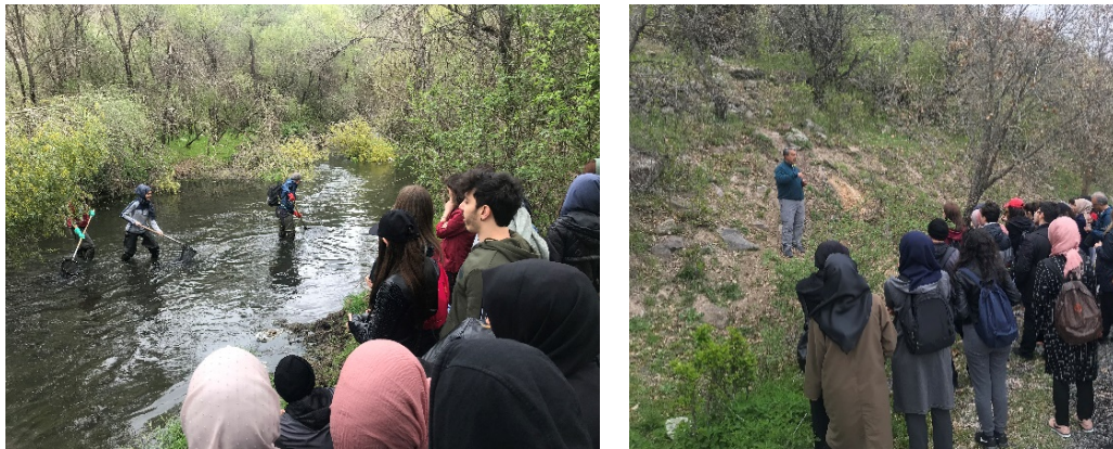
Figure 3. Photos from the scientific field trip