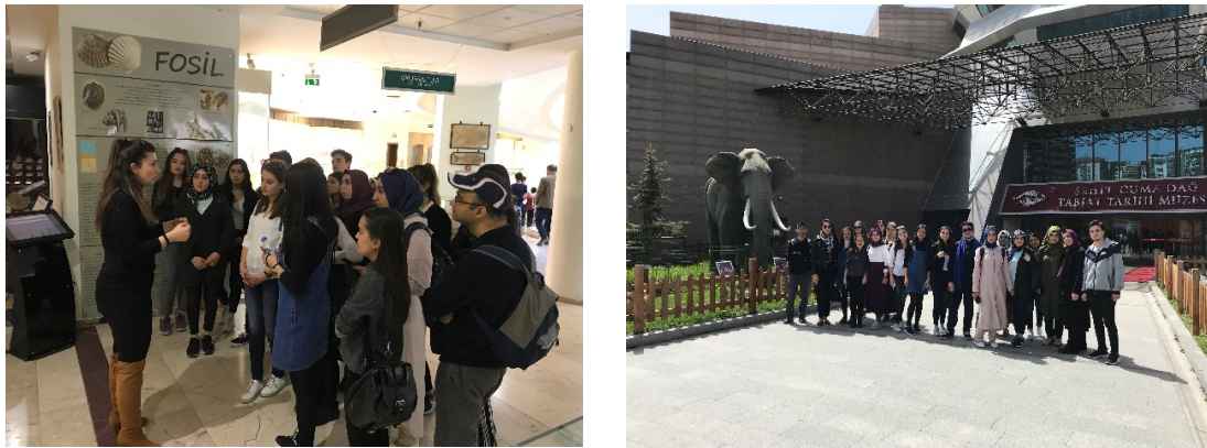
Figure 2. Photos from the museum visit