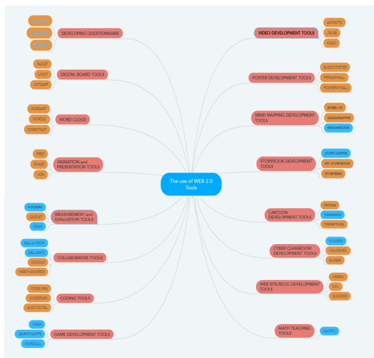
Figure 1. The use of WEB 2.0 tools

Below, 'The Use of WEB 2.0 Tools' was developed via Mindmeister, one of WEB 2.0 tools.