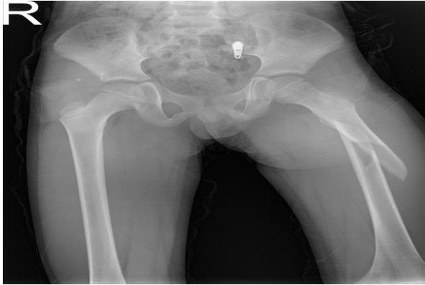
Figure 1. Radiograph of an 8-year-old male patient who was admitted to our clinic with left femoral shaft fracture after falling from a height

When the patients were admitted to the emergency department, anteroposterior and lateral radiographs were taken to visualize the fracture line (Figure 1). Immediate hip spica casts were placed in all cases to manage pain and deformities. Skeletal traction was not used for any patients.