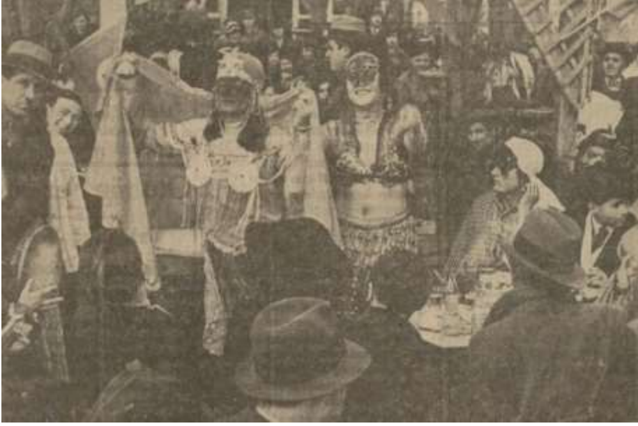
Figure 12: The last day of the carnival in 1938, Tatavla (Kurtuluş) 71

The smell of raki and the sound of singing voices were spreading toward other districts. There was so much singing, playing and dancing that almost no one was listening, it was silent and standing. It was not possible to stand in the music halls or in the streets. The journalist asked a Rum citizen why it was so crowded. The Rum citizen responded that the fair had been held for 120 years in Kurtuluş. On this day, especially oysters and snails are eaten, no one gets angry with anyone, any bad language was considered a joke. Finally, when asked what else they did, he gave the answer “We become masquerade!” 72