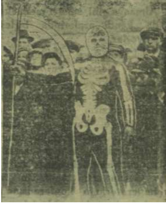
Figure 3: The masquerader dressed as Azrael 38

Another Turkish journalist, with a pen name “Pin”, said it would be unpleasant and meaningless to walk around as a masquerader in Beyoğlu. Many were singing bad songs and making a fuss. According to him, a lot of people were waiting for this carnival just to show their own ugliness and drabness.