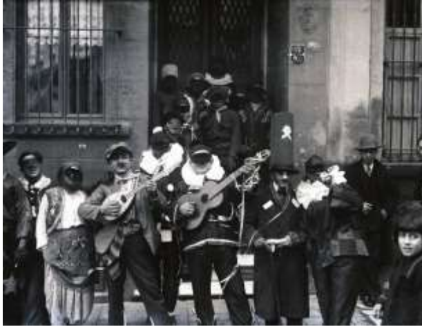
Figure 2: A group of masqueraders in 1930 33

Finally, the tram stopped at Sinemköy station. It was not possible for the tram to move because of the crowd. Everyone went towards the small, blue-painted holy spring on the side of the creek on the slope of the Kurtuluş hill. Masqueraders dressed in red, green, blue, and purple clothes took off their hats and cones and entered the holy spring. If you looked through the door of this small temple, you would see these colorful people praying with painted hands and faces. And when they were done with praying, they suddenly began to act crazily. Dances, songs, cavortings, yells... 32