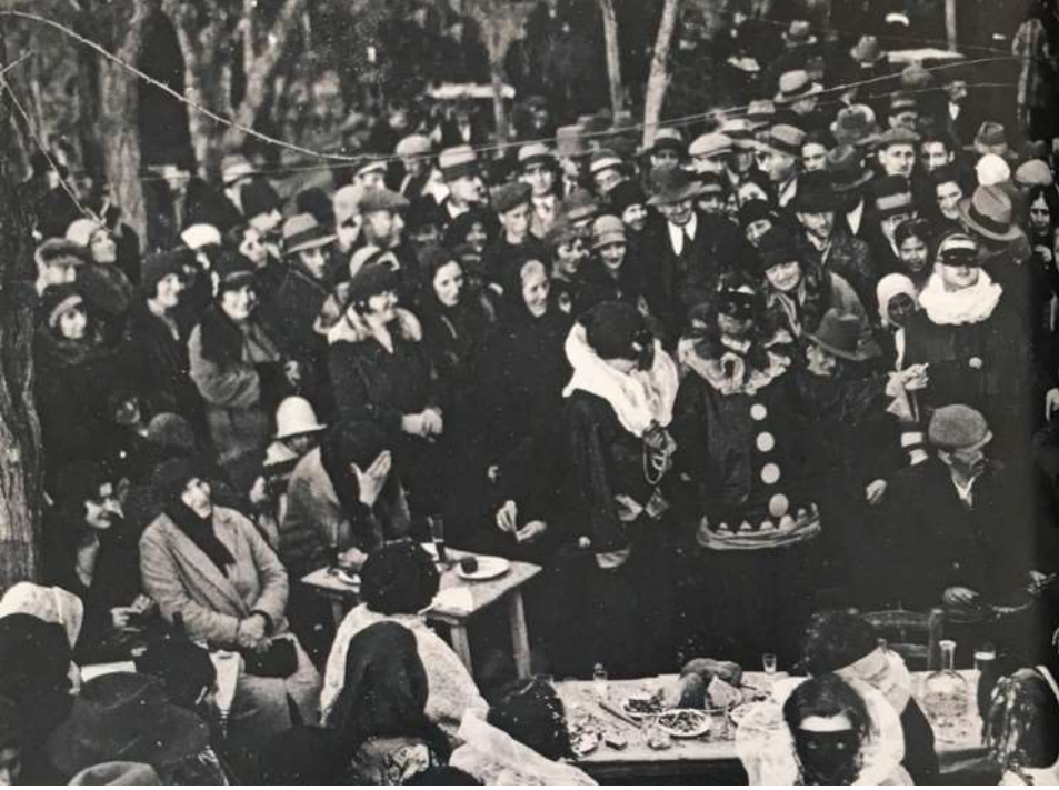
Figure 6: The last day of the carnival was on February 27th, 1933, Tatavla (Kurtuluş) 49