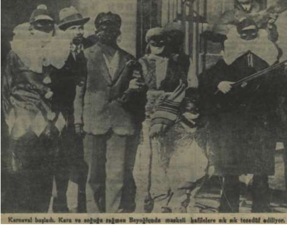
Figure 7: Masqueraders in 1934 51

"The carnival has begun. Despite snow and cold, masquerader groups are often gathering in Beyoğlu"