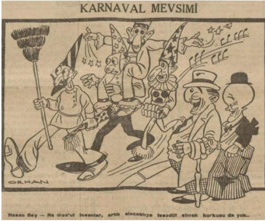
Figure 4: "Carnival Season" 42

"Mr. Hasan - What a happy people, there is no longer any fear of meeting a payee."