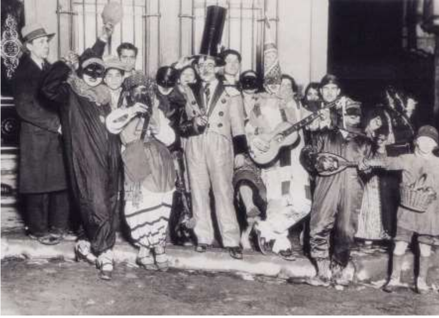
Figure 8: Masqueraders in the 1930s 54