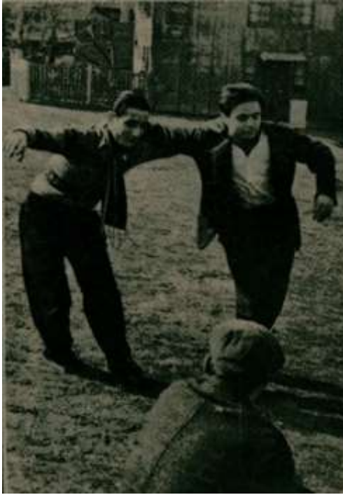
Figure 11: Two young men is dancing "polka" 65

Afterwards, they started to dance "polka". 64