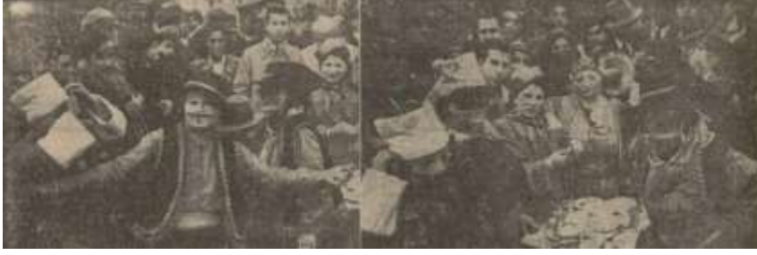
Figure 13: The last carnival of the 1930s 76

The last day of the carnival in 1938 was celebrated in warm weather which was full of floral scents that cannot be felt even in May. Some people wanted to go to Kurtuluş by taking trams or buses, but it was not possible to get on them because of the crowds. So, they decided to take shared cabs. While they were trying to find a way to go to the fair, they were learning what the Apokries were or what one could drink (such as raki or wine), or eat (like olives, onion, broad bean) during the fasting period.