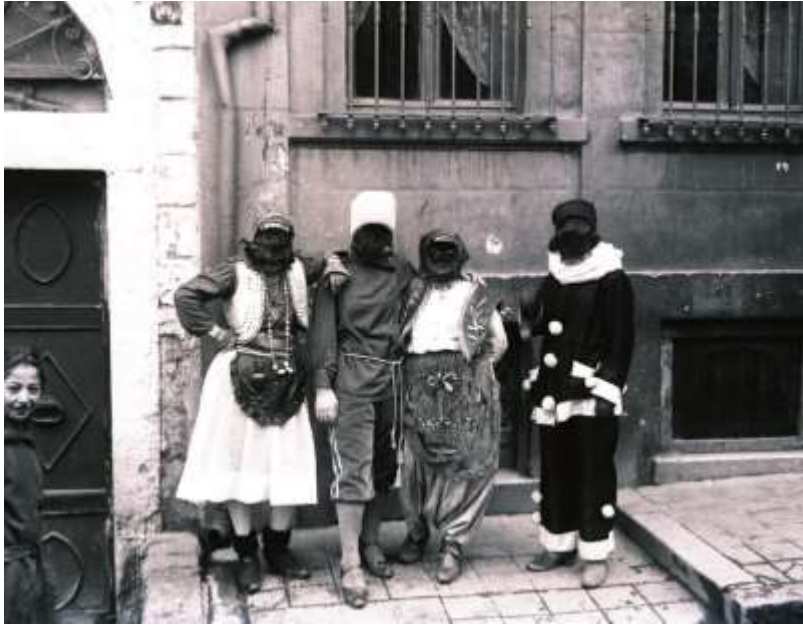
Figure 1: Four masqueraders at the carnival celebrations in 1930 29

Some journalists wrote their impressions of the carnival in 1931. One of them was Osman Cemal Kaygılı. He heard some noises such as “The funeral is coming, the funeral is coming”, while he was walking to Kurtuluş with the crowd. There were candle holders and hymnists in the front, the coffin in the middle, and weepers in the back. He realized that this cortege was a masquerader group, while he was worrying about how the cortege would pass inside this crowd.