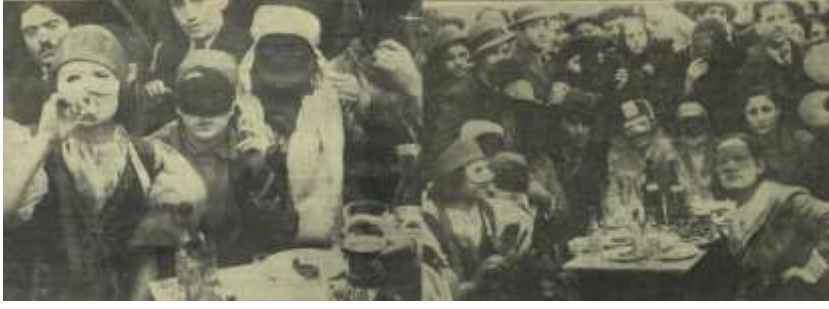
Figure 10: The last day of the carnival in 1936 62

It is impossible to walk through the crowd of masqueraders on the streets. Everyone is talking about being a masquerader.