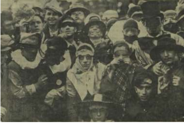
Figure 9: A masquerader group in Beyoğlu, 1935 60

While the carnival entertainments were organized every year, the criticism continued in parallel. For one of the journalists, the end of the carnival means getting rid of the spoiledness and coldness of masqueraders. The masqueraders in İstanbul were far-fetched, unnatural and fake. Their clothes were old and did not follow any style. When a person realized these masqueraders, he could almost cry. 61