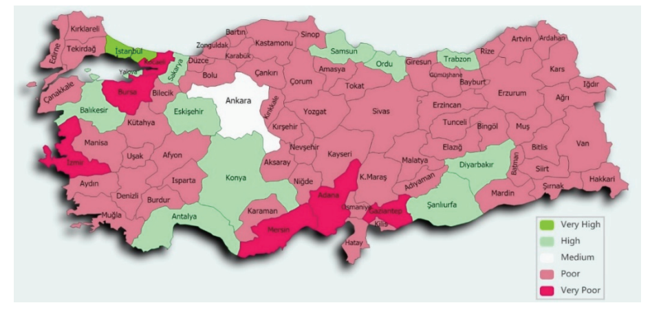
Figure 2 - Municipal water distribution model results for 2006 according to Hierarchical Gray Relational Clustering

Figure 4 shows how the management of the distributed water changed over 10 years. This figure illustrates the general structure of the long-term change result of the HGRC spatial distribution maps depicted earlier in Figures 2 and 3. It demonstrates that Izmir, Bursa, Kocaeli, and Gaziantep Provinces displayed positive developments in distributed water management over the decade. The Aegean region, on the other hand, is the region where water management generally worsened. It was also determined that in the Central Anatolia region, Eskişehir and Konya managed to distribute water poorly. Figure 4 shows that in the Eastern Anatolian region, water distribution in Erzurum, Şanlıurfa, and Diyarbakır has deteriorated. On the other hand, the provinces colored white showed no change in distributed water management level between 2006 and 2016.