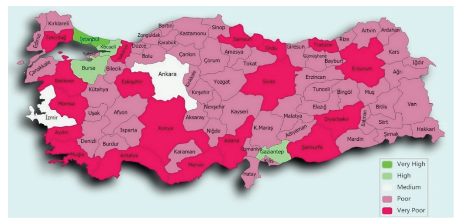
Figure 3 - Municipal water distribution model results for 2016 according to Hierarchical Gray Relational Clustering