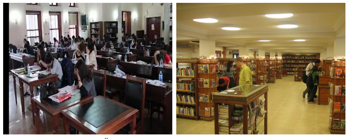
Figure 2. Ankara Adnan Ötüken Provincial Public Library study room and lending services