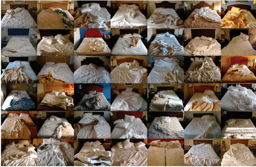
Figure 4. Tracking transience (Elahi, 2011)

Trevor Paglen is known for his work exploring the hidden elements of surveillance and the militarization of everyday life (see Figure 5 for example). In an article from The Guardian entitled Trevor Paglen: Art in the age of mass surveillance , the journalist Tim Adams, who interviewed Trevor Paglen, described his work as follows: