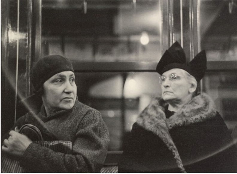
Figure 1. Subway Portrait (Evans, 1938-1941)

Another pioneering photographer in the 1930s was Erich Salomon. He too aimed to achieve greater authenticity and so took photographs secretly of court proceedings, political meetings and other private functions attended by well-known figures and politicians where photography was prohibited. Salomon hid a 35mm camera in his hat and took photographs using a viewfinder. Salomon had quite a different audience in mind, compared to Evans, as he was a press journalist. Salomon described his practice in the following terms: