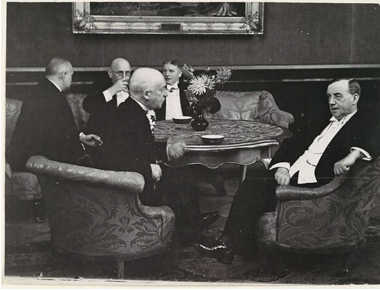
Figure 2. Five gentlemen conversing around table (Salomon, 1920s–30s)

The work of South African photographer Pieter Hugo provides an interesting comparison with the work of Walker Evans, as Hugo himself acknowledged. Published in 2014, his work entitled The Journey shows people asleep on a long-distance flight (see Figure 3 for example). He used the infrared function on his camera and so, as with Evans and Salomon, he was using up-to-date technology to take photographs without the subject being aware. It is difficult to view these photographs without concluding that they are intrusive and voyeuristic. Hugo recognises this himself: "I wonder how the people I photograph will feel about these pictures. In this age we demand that celebrity be placed within the public gaze but have a conflicting ethos for our own representations" (Hugo, 2014).