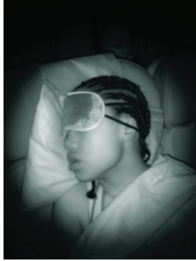
Figure 3. The journey (Hugo, 2014)

pline or control, or commercial gain. It would be difficult, anyway, to identify the individuals involved. The purpose is essentially artistic and to raise questions about photography as a surveillance tool. Even in our most unguarded moments we can easily be captured on film. There is however a moral ambiguity about these images. Is the photographer contributing to and supporting surveillance culture or is he raising questions about the morality of that culture instead? The photographer may have crossed a line about what is acceptable and may have infringed on people's privacy, even though it is for artistic purposes. I will explore the privacy issues and the wider moral dilemmas that photographers face later in this paper.