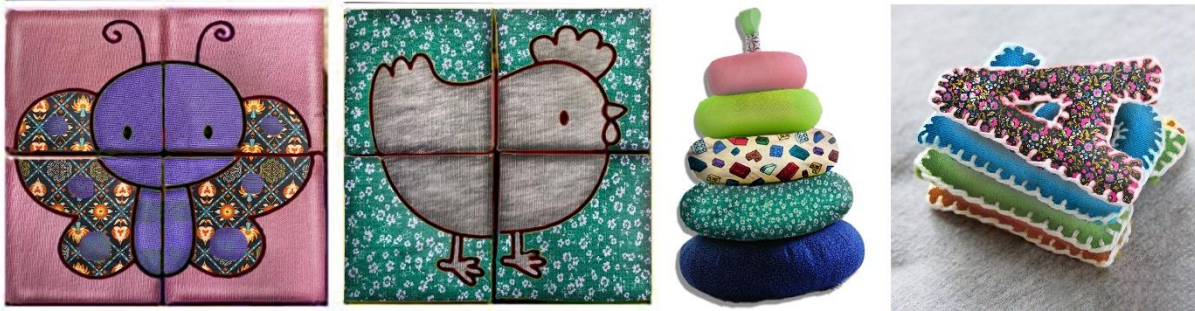
Image 2. Examples of trial molds for educational toy production (Project archive, 2022).

In addition to baby and animal-themed toys, educational toys such as puzzles and fabric stacking rings were also produced within the scope of the project. Puzzles required assembling pieces to form a complete picture. Various animal images were used in the puzzle toys produced as part of the project. Through these puzzles, children not only develop their problem-solving skills and hand-eye coordination but also enhance their ability to focus. Moreover, children learn about shapes, colors, patterns, and object relationships through these puzzles. The fabric stacking rings, on the other hand, are toys used to improve children's hand-eye coordination and fine motor skills. By stacking the fabric rings of different colors and patterns to form a tower, children develop their skills in object sequencing, organization, and manual dexterity (Figure 2). After the production of samples, more than 1000 toys were made from 84 kg of knitted fabric by the researchers in the project design team, which were intended to be gifted to children during planned or unplanned project activities.