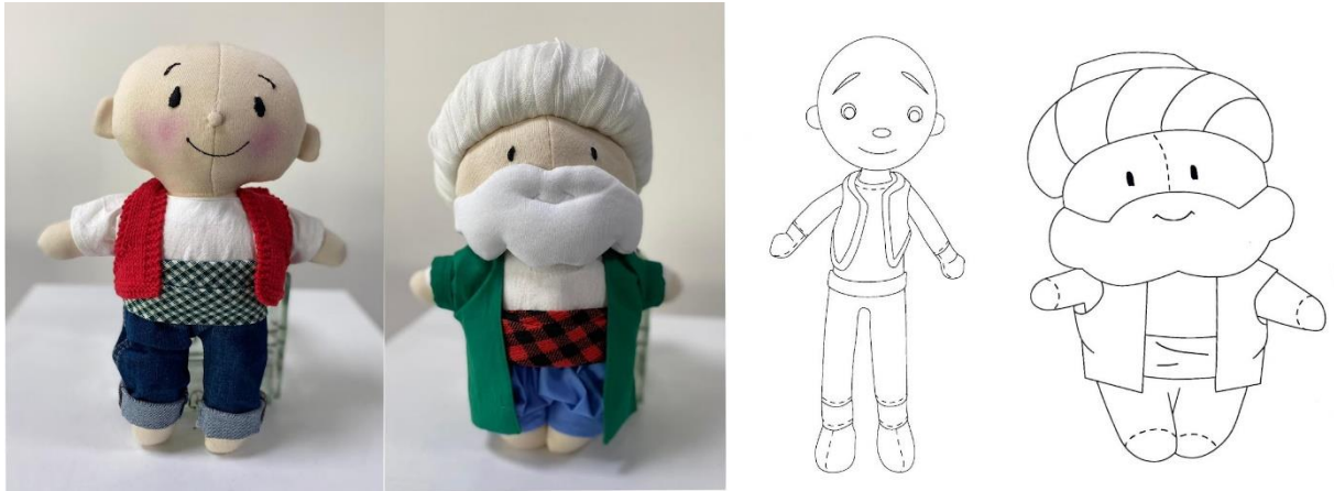
Image 11. Application of Nasreddin Hodja and Keloğlan fabric toy (Project archive, 2022).