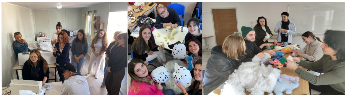
Image 8. Workshop activities conducted within the scope of the project.

Workshop activities were conducted in collaboration with students from the Fashion Design Department of the Faculty of Fine Arts, taking into account design and artistic approaches, in addition to training on the use of sewing machines acquired from the project budget for toy production purposes (Figure 8).