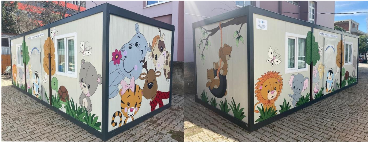
Image 3. Visual design of the toy workshop (Project archive, 2022).