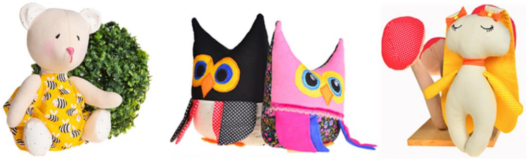
Image 6. Exhibition photographs of recycled toys (Project archive, 2022).

The captured photographs and videos have been shared for the visibility and recognition of institutions such as Dokuz Eylül University, Faculty of Fine Arts, Children's Oncology Institute, and the project and stakeholder organizations (Figure 7).