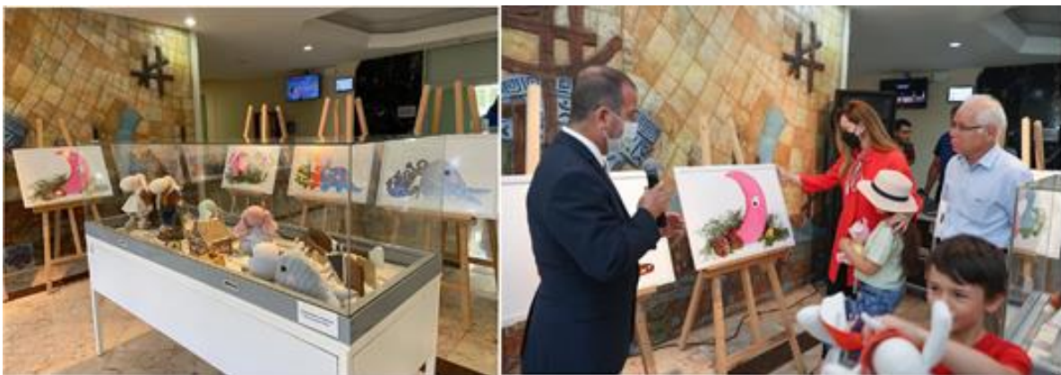
Image 5. Sustainable stories exhibition with toys.

However, these fabric toys, produced by utilizing waste materials in line with the project's objectives, not only secure our children's present but also their future. Unlike toys made of plastic that poison our planet and disrupt the balance of natural life, these handmade toys are crafted from renewable, biodegradable, and recyclable materials. Each toy is unique with its own distinct decorations and details.