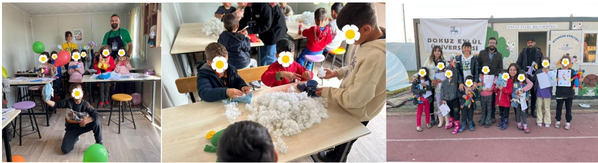
Image 9. Adıyaman eğriçay park, 7earthquake zone.

Following the devastating earthquake disaster that deeply affected Kahramanmaraş and 11 other provinces, causing nationwide mourning in Turkey, Dokuz Eylül University contributed to the psychosocial activities by sending aid and support teams to the earthquake-stricken areas. As part of the efforts to provide support and morale to the children in these regions, the "Toy Workshop" of the project was relocated to Adıyaman with the support of the University's Faculty of Fine Arts faculty members and volunteer students (Figure 9). Supported by the University's own resources within the framework of Dokuz Eylül University Scientific Research Projects (BAP), the Toy Workshop was established in the earthquake zone 7 area in Adıyaman, where children had the opportunity to create toys using non-toxic and antibacterial fabrics. The design of the Toy Workshop was entirely child-oriented, creating a pleasant and comfortable environment for them. In the aftermath of the major disaster, our volunteer academicians aimed to support the children by providing them with our handmade fabric toys, helping them overcome their pains and fears and bringing a little smile and happiness to their faces. Hundreds of children affected by the earthquake have participated in the production of fabric toys as part of the workshop activities and have received these toys (Figure 9).