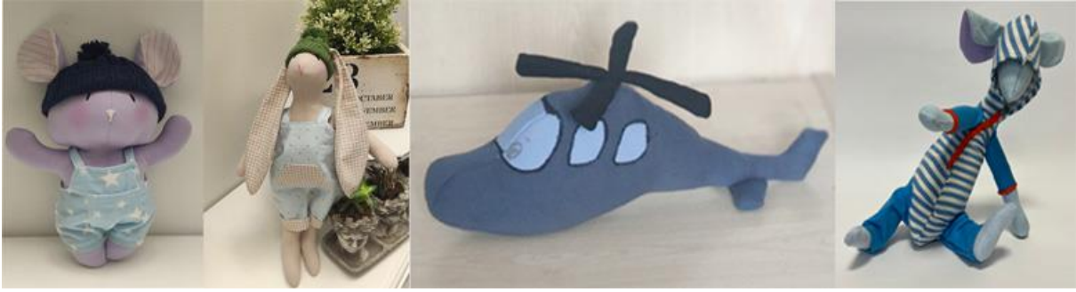
Image 1. Toy production mold trial samples (Project archive, 2022).

In addition to baby and animal-themed toys, educational toys such as puzzles and fabric stacking rings were also produced within the scope of the project. Puzzles required assembling pieces to form a complete picture. Various animal images were used in the puzzle toys produced as part of the project. Through these puzzles, children not only develop their problem-solving skills and hand-eye coordination but also enhance their ability to focus. Moreover, children learn about shapes, colors, patterns, and object relationships through these puzzles. The fabric stacking rings, on the other hand, are toys used to improve children's hand-eye coordination and fine motor skills. By stacking the fabric rings of different colors and patterns to form a tower, children develop their skills in object sequencing, organization, and manual dexterity (Figure 2). After the production of samples, more than 1000 toys were made from 84 kg of knitted fabric by the researchers in the project design team, which were intended to be gifted to children during planned or unplanned project activities.