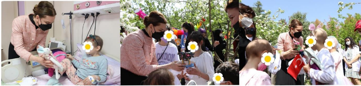
Image 4. Visit to deu children's hospital institute of oncology on April 27, 2022.

The Project, supported by Dokuz Eylül University, which continues its academic and scientific activities with a sense of community service, was introduced to the audience and national media through an organized exhibition. The Sustainable Stories Exhibition with Toys took place in the foyer area of Dokuz Eylül University's Cultural Heritage Rectorate Building from June 20, 2022, to July 4, 2022 (Figure 5). The fabric toys, produced by expert academics within the project, were designed in different characters by five project team members who are faculty members of DEU Faculty of Fine Arts Fashion Design Department. The exhibition aimed to raise awareness of conscious consumption of limited resources for future generations and featured 64 upcycled fabric toys. Plastic toys, which contribute to global warming and are made of toxic materials and chemicals, are difficult to recycle.