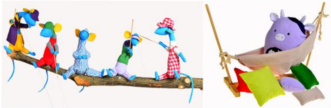
Image 7. Exhibition photographs of upcycled toys.

The photographs of the toys produced in the project have also served as a means of preserving the project's memory. As part of the social responsibility and project requirements, the toys are distributed, and only the photographs remain. The photographs have become a creative source of data for the design of new toys, ensuring the preservation and development of originality to avoid repetition in the realization of the imagined. Due to the interdisciplinary nature of the project, the photographs are used as a supportive media in which all stakeholders can benefit, serving as a mediated form of the generated knowledge. Furthermore, the production process of the fabric toys, the use of recycled materials, the handcrafted nature, and adherence to sustainability principles have been documented through photographs. In the future development of the project, the photographs can be utilized as ready-made resources to support entrepreneurial positioning and marketing strategies.