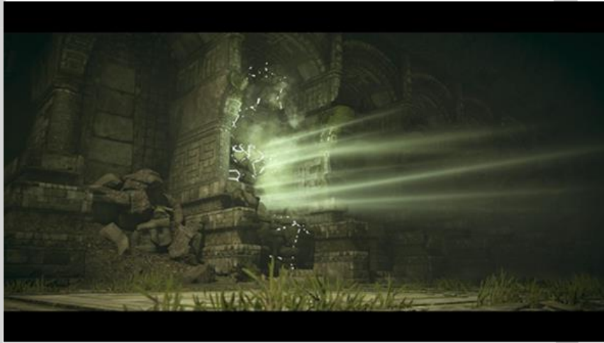
Figure 6: Destruction of a representational figure right after the defeat of its colossus (Team Ico, Bluepoint Games, Japan Studio. 2018).

moves! But there are so few games that put the player into a situation that is to be ashamed of. And there are but fewer players who take a step on the other side of the fence as a player and see the big picture. The game, therefore, as Cesar (2018) states, gives this concept of responsibility through an amplification of qualities which the gamer community demands like good graphics/mechanics/dynamics, replayability and such... as a promotion to help testadura to play the game for a chance to catch the true meaning of the narrative in the end. This is the means by which the message is conveyed insofar as any medium is chosen for a narrative within the videogame industry. For it has become the golden standards of every commercially successful project of the “Users’ choice”.