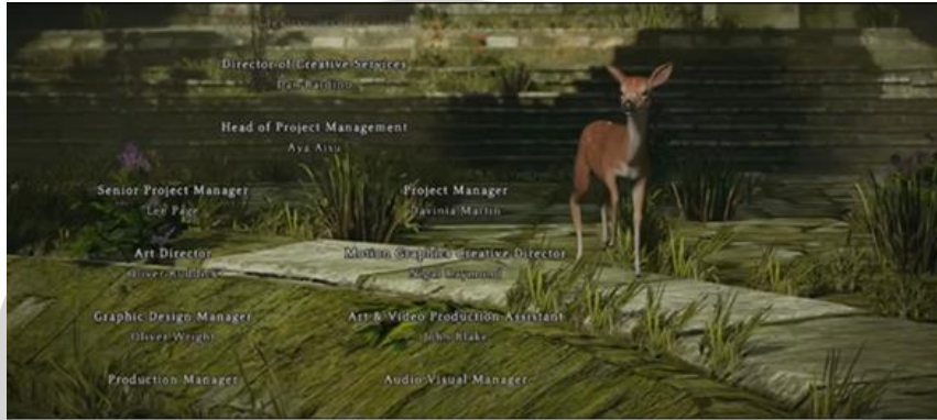
Figure 4: The stag as a representation of Nimrod (Team Ico, Bluepoint Games, Japan Studio. 2018).

disrupting the whole mechanical and perceptual system of the player.” (Lehner, 2017, p. 68). From a Freudian perspective the process here is experienced by the player within the self-alienated ego-ideals of that society personified within the form of Wander.