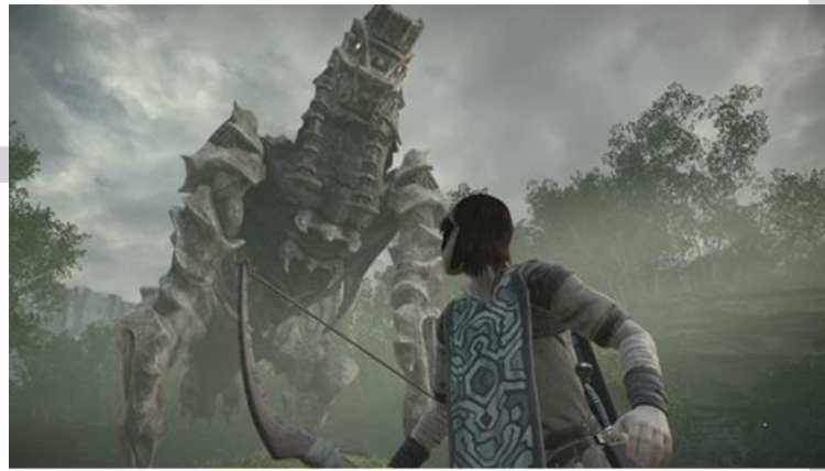
Figure 7: Wander, a hunter like Nimrod, while hunting a colossus (Team Ico, Bluepoint Games, Japan Studio. 2018).

In Shadow of the Colossus (Team Ico, Bluepoint Games, Japan Studio. 2018), players are being forced to question their own moral codes. This hypodermic model chosen to create a dialectical strain met with a discovery of something that, in Plato's words: "is thrice removed from the truth" (Plato, 2004, p. 241). The sole purpose of the game that is to save the beloved from being dead, which is the primary drive that conveys the player to reach to the end of the narrative encapsulates the player as a form of art created for an imitation of an emotional state to show that the player is being misled from the truth itself. Mitgutsch explains this process as a relearning experience, an experience to be gained at first to raze it to the ground and build anew by looking upside down, the other way around and finally to see something quite different the first time (Mitgutsch, 2009, p. 19)