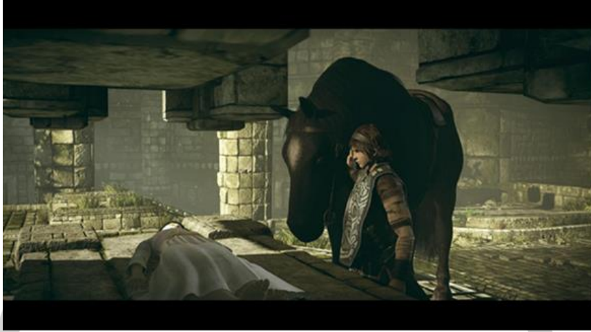
Figure 5: Wander by Mono with his horse Agro (Team Ico, Bluepoint Games, Japan Studio. 2018).