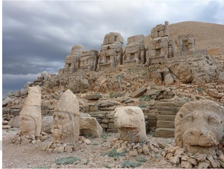
Figure 3: Antiochos himself and the gods of his syncretistic Graeco-Persian pantheon: Artagnes-Heracles-Ares, Apollo-Mithras-Helios-Hermes, Zeus-Oromasdes, and a new goddess, "all-nourishing Commage, Eastern Terrace of Mount Nemrud. (Downey, 1997, p. 95).

The man is all that is civilized-learned, kindly, idealistic, decent. The shadow is all that gets suppressed in the process of becoming a decent, civilized adult. The shadow is the man's thwarted selfishness, his unadmitted desires, the swear-words he never spoke, the murders he did not commit. The shadow is the dark side of his soul, the unadmitted, the inadmissible... He confronts his dark self at last, but instead of asserting equality or mastery, he lets it master him. He gives in. He does, in fact, become the shadow's shadow, and his fate then is inevitable (Le Guin, 1975, p. 140).