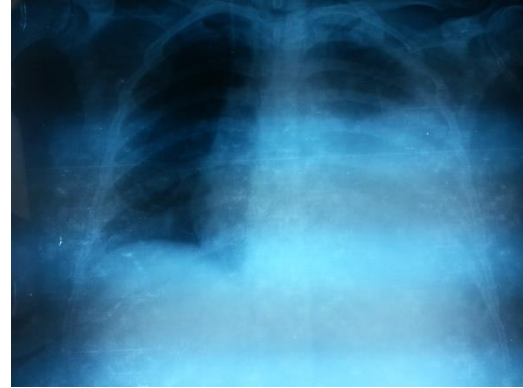
Figure 2: A left pleural effusion in thorax x-ray.

tomy region. The abscess was percutaneously drained under BT guidance. In control CT, there was a minimum collection about 3x2 mm in diameter. The further intervention was not suggested by radiologists. The patient was followed up with antibiotherapy. There was also minimal pleural effusion with no clinical symptoms.