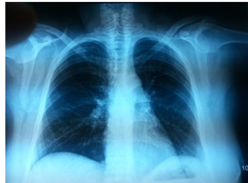
Figure 4: Treated effusion in thorax x-ray.