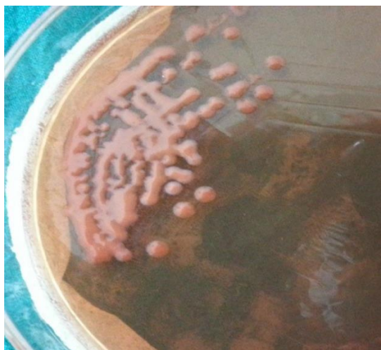
Figure 3: Lactose fermenting mucoid colonies of Klebsiella pneumoniae on Macconkey agar.