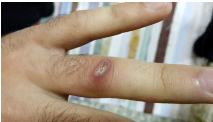
Figure 1. Skin cut on the day of injury. The photograph was taken by the patient with his phone camera.

Twenty-three year old male student in fifth-grade of Medical Faculty, was admitted to the Hand Surgery Clinic due to a skin lesion on his left ring finger. The patient mentioned that 20 days before admission, he had slaughtered a goat with the help of two relatives on the first day of Sacrifice Feast, one of Muslim holidays. He reported an accidental cut on dorsal aspect of his left ring finger (Fig. 1). He had managed bleeding with mild compression, wrapped the wound with adhesive plaster after checking active finger motions which was normal and continued meat processing. He mentioned appearance of a dark brown colored, circular, bulging lesion on the wounded skin six days after the injury and no associated fever or lethargy. He had already applied to Dermatology and Infectious Disease