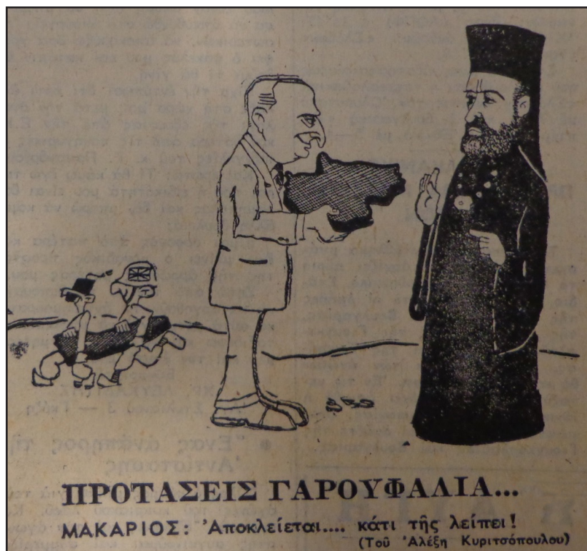
Caricature: Ta Nea 22 Augustos 1964 114

“When Garoufalias proposed instant enosis, I asked him: In the case of a Turkish military invasion in Cyprus what would be the Greek governments’ position? The Greek minister replied that in this case the US would intervene. My other question was whether the US was aware of this plan. Garoufalias replied to me yes! It was clear that this was collusion aimed at implementing the Acheson plan and de facto division of the island” 112 . He also explained his reasons to the Greek ambassador to Cyprus (1964-1970) Menelaos Alexandrakis: “The Greek embassy had no information about the secret talks between Makarios and Garoufalias. Nearly three months later, on my question Makarios said to me that even though he had considered the instant enosis he rejected it because it would be “stupid heroism”. I would be a hero and the result would be the intervention of Turkey and partition. Greece would be totally weak to do anything. The abolishment of the Cyprus government with our own initiative would be national harm for Cyprus and Greece” 113 .