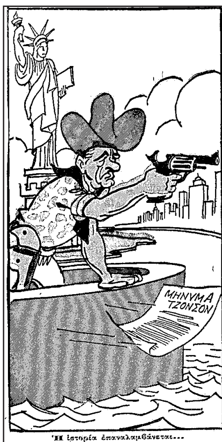
Caricature: Makedonia , 15 Iouliou 1964 75

ability exploit the issue in Greece; eliminate the security concerns of Britain, Turkey, Greece and the US; reduce the danger of the growth of communism on the island, end Makarios' "neutral" foreign policy maneuvering and give the US a friendly government with which to negotiate a satisfactory status for the American communications facilities" 73 . Labouisse agreed with Belcher: "Unfortunately, so long as the Greeks are convinced that "justice" is on their side and that the U.N. will support their view of justice; there is precious little initiative to be expected from them to date. The only proposals to this end which Papandreou has advanced have been his suggestion that enosis would meet Turkey's security worries by having Cyprus become part of NATO". The alternative was to have a second Cuba in the Mediterranean. According to Lord Harrington