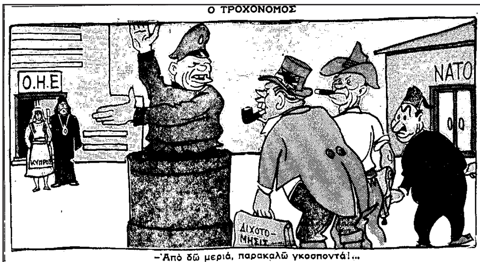
Caricature: Makedonia, 12 Fevrouariou 1964 40

was to create a central government in Cyprus. When he achieved this, his aim was to bring the Cyprus issue to the UN Security Council, to discuss and unchain Cyprus from the Zurich and London agreements. At this point he believed that his best option was to seek help from the Soviets 39 . And the Soviets, who saw the conflict as an opportunity for the expansion of their influence in the region, were willing to bring Makarios back if he managed to take the issue to the UN agenda.