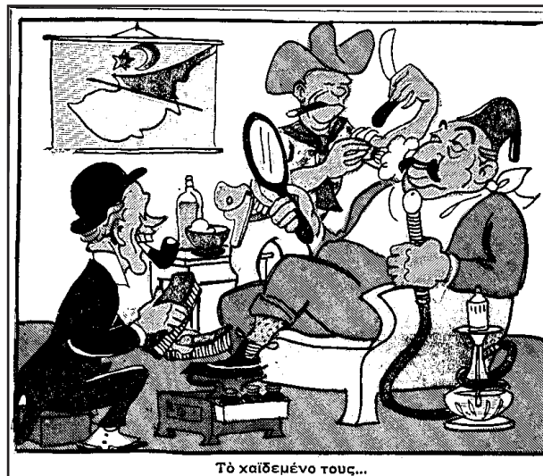
Caricature: Makedonia , 24 April 1964. 72

slogans: “Yankees take the fez out”, “NATO out”, “America and Britain take your hands out of Cyprus” 69 . The Greek Newspaper Ta Nea (the best-selling newspaper of the period) began publishing a series of articles with the headlines: “Vietnam: dirty war”. Another headline of the same newspaper was: “America is in a difficult situation: strikes, disasters, declining reputation” 70 . A repressive policy towards publications that criticized Greece’s policies on Cyprus and Makarios was seen. The BBC and the Voice of America, which were broadcasting on Greek National Radio, were first “warned” because they were broadcasting the words and meanings of an attack against the Greek national dignity and reputation 71 . Soon both would be closed.