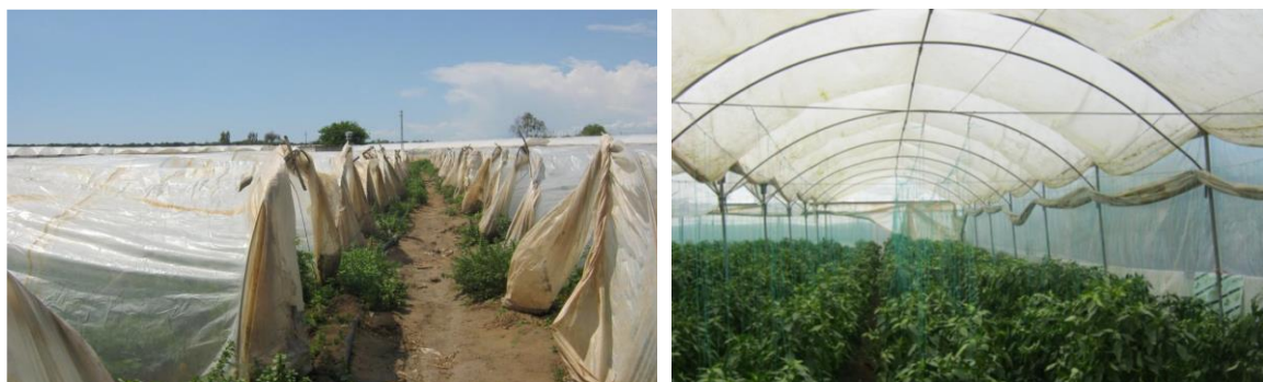
Figure 2. High tunnels and greenhouse with roof spring pipe system in the reseach area