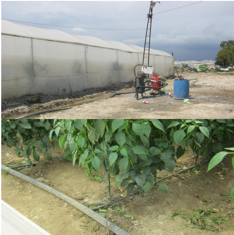
Figure 4. Water supply, drip irrigation system and control unit in greenhouse

Producers choose the irrigation technique based on the region's land conditions, the variety of plant being cultivated, and any pest and disease problems. Artesian wells are utilized by all producers within the research area for irrigation (Figure 4).