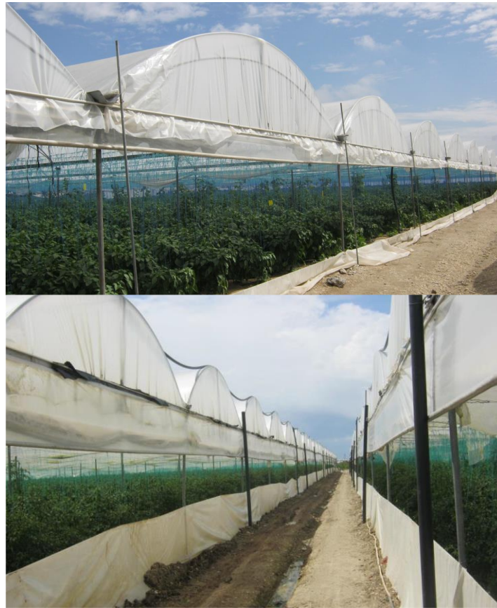
Figure 3. Ventilation on the front and side parts of plastic greenhouses

summer rather than the winter months in Coşkun and Filiz's (1997) study on the PED fan system, an active cooling system in greenhouses in the Mediterranean environment. The study's findings revealed that the internal temperature of the greenhouse dropped to an average of 25 °C when the fan, pad, and shade system were all used simultaneously and this temperature is sufficient for the plant's growth. Similar strategies ought to be applied in this situation to boost output in the field of work along with related areas. In a related study, Sevgican (1999) noted that roof ventilation systems in Turkish greenhouses are not operating at the optimal level and clarified that roof ventilation in greenhouses should be applied at a rate of 20% of the floor area in order to provide optimum ventilation. This value has been determined at 1-4% levels in greenhouses in Turkey.