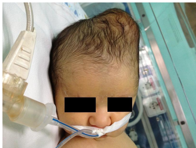
Fig. 1. Patient's phenotypic view. Note the swelling on the left frontoparietal region of the scalp

On physical examination general condition was poor and he had no spontaneous ventilation. Jaundice and pallor were present. The apical heart rate was 176/minute and blood pressure was found to be 58/36 mmHg. On the left frontoparietal region of the scalp 5x5 cm swelling was detected (Fig-1). On neurological examination, hypotonia, a bulging fontanelle, decrease in response to light reflex and bilateral miosis were found.