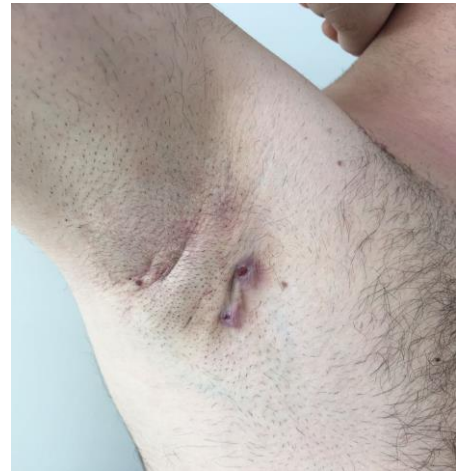
Figure 2. Fistula with two openings and atrophic scars on the right axillary area at 3 months

patient had clinical improvement in abscess lesions in month 3 (Figure 2) and in sinus tracts at the end of month 6 (Figure 3). In addition to this; according to HISCAR clinical response was seen in 9 patients (75%) (Figure 4). All of the patients included in this study were called separately and suggested to answer the questions in the Dermatology Life Quality Index (DLQI) questionnaire. All of the patients responded to treatment orally defined that; there has been no newly development or if present; it has occurred as smaller than the previous ones and the lesions disappeared more quickly. Besides, they reported that the exudation has stopped, no abscess has developed as the priors and the bed smell have already decreased or disappeared. In 7 patients; a decrease from Hurley 3 to 2, and in remaining 2 of the 5 patients with Hurley 2; a decrease to Hurley 1 were recorded after adalimumab treatment (Table 1).