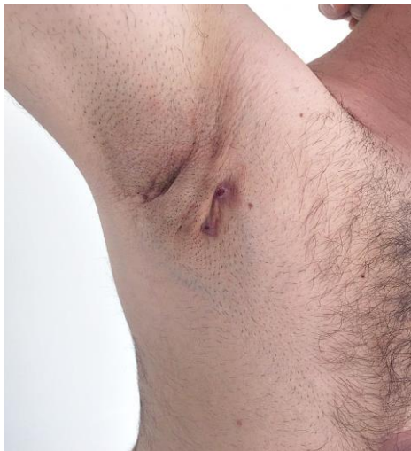
Figure 1. The subcutaneous abscess formation on the right axillary area accompanied with fistula with two openings and atrophic scar tissue before the adalimumab treatment

Before the treatment involvement of Hurley stage 3 were seen in 7 patients, and Hurley stage 2 were observed in remaining 5 patients (Table 1). In all patients at least one or more inflammatory nodules and involvement of 2 or more anatomic areas were observed. The presence of abscess, sinus tracts and atrophic or hypertrophic scars were detected. Axillary and inguinal regions; in 9 patients (75%), chest; in 3 patients (25%), perineal or perianal areas; in 1 patient (8%), submammary area; in 1 patient (8%) and penile area; in 1 patient (8%) were involved (Table 1). The clinical photograph of a patient having an involvement of Hurley stage 3, subcutaneous abscess formation in right axillary area, fistula with two openings and an atrophic scar area is given in Figure 1.