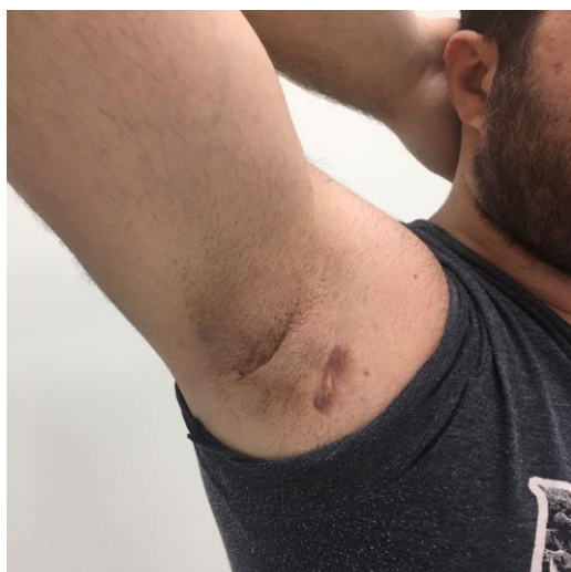
Figure 3. Atrophic scar areas on the right axillary area at 6 months

Before the treatment DLQI score was 14.4 \pm 6.9 (range 7-21), but after the treatment DLQI score was found as; 4.3 \pm 3.8 (range 1-8) ( p < 0.05 ). Besides, before the corticosteroid treatment dermatology life quality index (DLQI) was found as 13.7 \pm 5.3 (range 7-21), but it was 11.3 \pm 2.1 (range 5-12) after the treatment. Before the systemic antibiotic use, DLQI score was 13.2 \pm 3.3 (range 8-21), but after the treatment; it was 10.1 \pm 2.4 (range 3-12) and before the retinoid use DLQI was recorded as; 14.7 \pm 5.2 (range 8-17) and after treatment as; 9.4 \pm 2.3 (range 3-11) ( p > 0.05 ). We also ascertained that after the treatment a consultation was made to a nutritionist for all patients and started on either a lower fatty diet or a specialized diet accepted for patients with diabetes mellitus and metabolic syndrome.