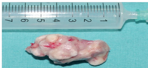
Figure 3. Totally excised mass of ethmoidal osteoma