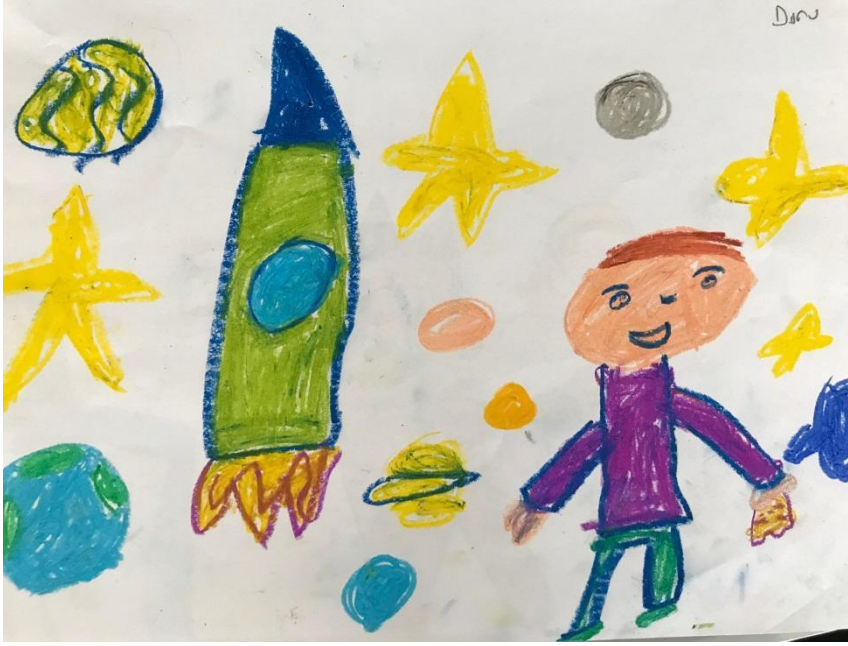
Picture 4, which was drawn without looking