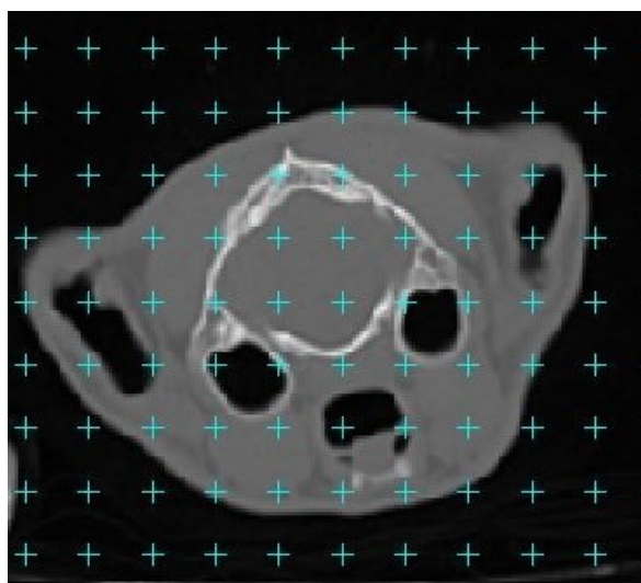
Figure 1: A point counting grid that superimposed on CT slice.

For statistical data, SPSS 20 program was used. In the study, normality was subjected to the Shapiro-Wilk test. Independent t-test was applied to the differences between the sexes.