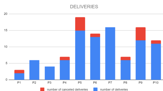
Figure 3. Number of completed and cancelled deliveries