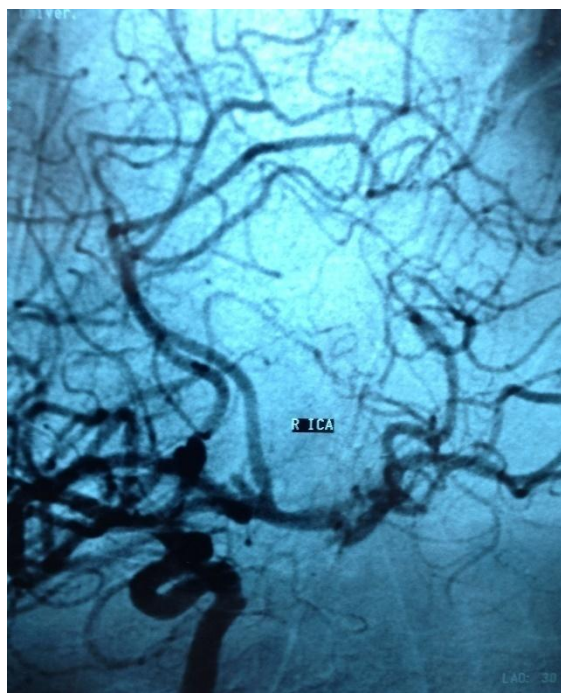
Figure 3. Angiography from right ICA showing ACoA left MCA perfusing via ACoA.