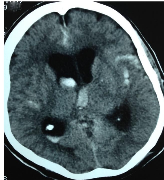
Figure 1. Preoperative CT revealed SAH and hydrocephalus.

The patient was evaluated as grade 4 according to both World Federation of Neurosurgical Societies grading system and Fisher's classification. Ventricular drainage was performed to relieve hydrocephalus. Angiography revealed an aneurysm of the anterior communicating artery (ACoA) (Fig. 2), absence of the left ICA and both anterior cerebral arteries (ACA) and middle cerebral arteries (MCA) perfusing from the right ICA via the ACoA (Fig. 3, 4). Presence of the left carotid canal was demonstrated on CT (Fig. 5). Angiographic atherosclerotic findings and presence of the bony carotid canal suggested spontaneous occlusion of ICA. Successful clipping was performed via a right pterional approach. Postoperative course was eventful and suggested vasospasm (Fig. 6). The patient died at post operative eighteenth day.