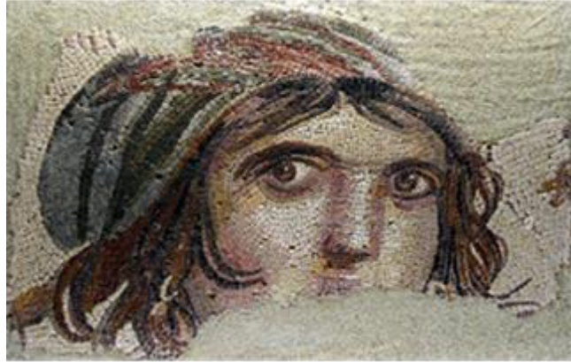
Photograph 1: Zeugma Museum of Mosaic/Gaziantep "Çingene Kızı" (Gipsy Girl)

In broader sense, in mosaic, defined as the arranging technique bringing together one or multiple materials' small fragments, except glass and marble, materials such as ceramic, wood, enamel, and stone fragments also paper and fabric fragments can be used (Hasol, 1998; Demir, 2011).