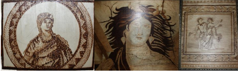
Photograph 24: Mosaic patterned pyrography pictures

Mosaic patterns in the Antakya Museum of Mosaic, are used in reproduction works (Photograph 23) and also patterns are used in different crafts in the region such as pyrography (Photograph 24).