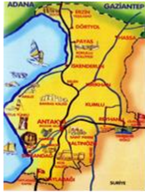
Photograph 3: Hatay city map.

Hatay is a border city, residing at the east end of the Mediterranean Sea. It covers 7 thousandths of the total country area. This 5.403 km 2 area reside between 35°52' and 37°04' north and 35°40' and 36°35' east. Hatay city is surrounded by Syria from east and south, Islahiye county of Gaziantep from northeast and Ceyhan and Yumurtalık counties and of Adana and Osmaniye from north and northwest and Gulf of İskenderun from west. In the city which has richness of history and touristic values, Castle of Antakya, Mosque of Habib-i Neccar, Sokullu Mehmet Paşa Social Complex, Kanuni Sultan Süleyman Inn, Church of Saint Pierre, Monastery of Saint Simon, Samandağ Çevlik Titüs Tunnel and Rock Tombs, Erzin İssos Ruins, Reyhanlı Yenişehir Lake and Harbiye is worth visiting. (Anonymous, 1997).