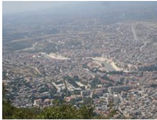
A view from Antakya centrum.