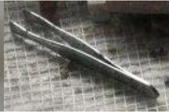
Photograph 5: Tweezers

As for the materials used: mosaic stones, granite and marble is preferred because they are solid and shiny (Photograph 6). In mortar mosaic, mortar and suture filling is required. In a mosaic without mortar, glue or a strong adhesive is used (Photograph 7). Besides these, a photocopy or a drawing of the picture to be made (Photograph 8), thick chipboard hardboard or cardboard the same size (Photograph 9), tape to stick the pattern to chipboard (Photograph 10), transparent nylon to use the pattern again (Photograph 11), and white netting is used to keep the board or picture portable (Photograph 12).