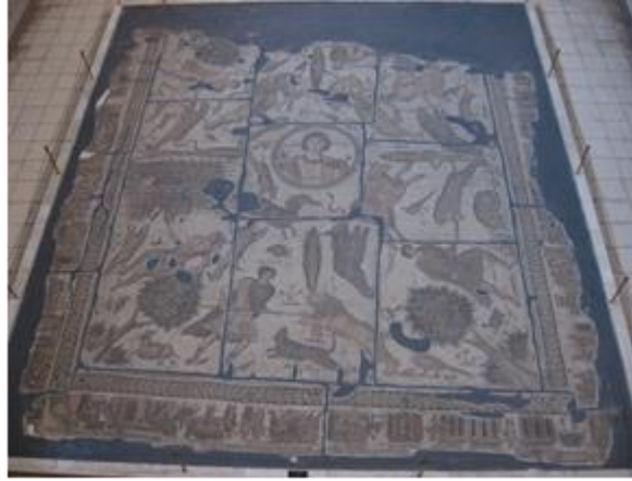
Photograph 2: Antakya Museum of Mosaic “Yakto Mosaic (5th century B.C. Defne-Harbiye)”

This art is applied extensively in ancient Rome, used mostly in floor, wall and arc decorations. Later, throughout all Middle Age, in Byzantine Empire, it is used in public architecture and Christian churches, in modern architecture, it is used in exterior decoration. It is understood that, mosaic technique is used in furniture and small sized art objects although not very extensively. The most interesting examples of this art can be seen in panoramic, large sized and partly monumental compositions (Genç, 1994; Karaçoban, 1996; Karakelle&Kayabaşı, 2013)