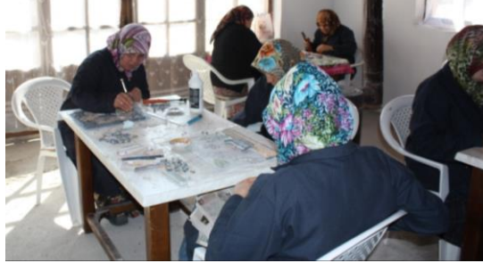
Photograph 27: Master mosaic craftsmen