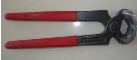
Photograph 4: Pincers

Tools used in mosaic making can be sorted as such: Pincers are the tool used in cutting the stones into triangles or quadrilaterals depending on the pattern (Photograph 4). Tweezers are used in mounting small stones into pattern or removing stones (Photograph 5).