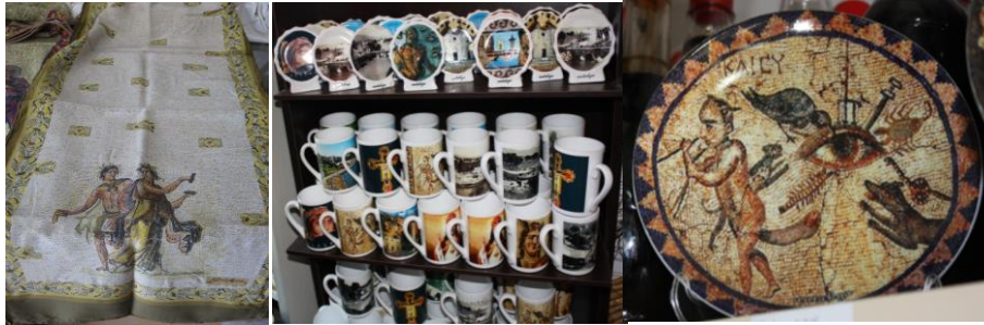
Photograph 22: Mosaic patterned souvenirs

Besides in the research, art of mosaic contribute to the promotion of the region with authentic touristic items and souvenirs. Mosaic patterned silk scarves, mugs, cups, plates trinkets etc. are the types of products (Photograph 22).