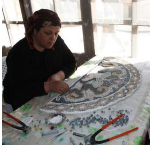
Photograph 26: Mosaic village established in Şenköy as part of SODES in 2012