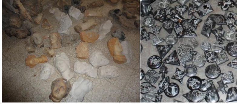
Photograph 26: Products made using various stones.

In the region, in stone working, other than mosaic, pendants, various trinkets and little statues made from onyx and basalt are also important (Photograph 26).