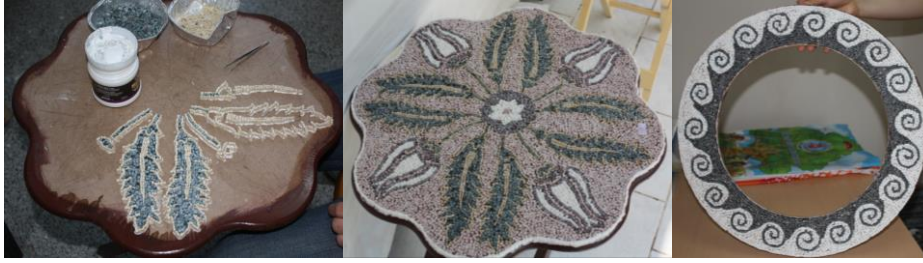
Photograph 21: Table and mirror frame

Besides panels and pictures, mosaic is applied to different materials. Tables, mirrors and picture frames, trivets, vases and various decorative products can be given as examples (Photograph 21).