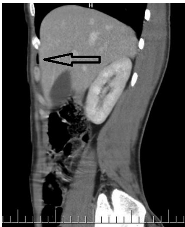
Figure 2. Sagittal scan of CT showing (arrow shows the free air anterior of the liver).

evidence of perforation was found in the distal esophagus, stomach and duodenum. The small bowel and colon also examined, but no leakage was observed and there was no evidence of pneumatosis cystoides intestinalis or other pathologies. Abdominal cavity