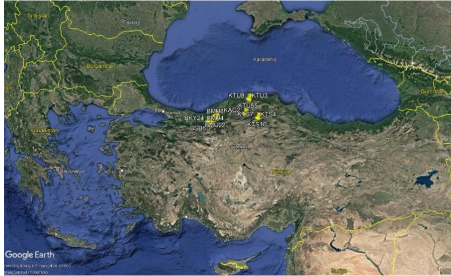
Figure 1. Locations of sampled natural C. colurna populations in Türkiye (see Table 1 for population numbers).