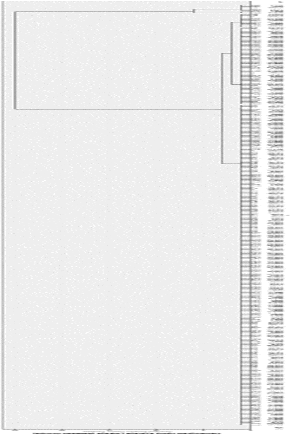
Figure 3. Cluster analysis based on the rootstock.