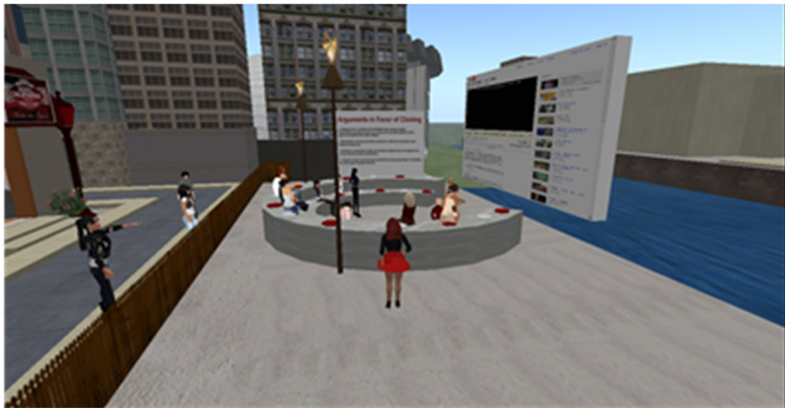
Figure 2. Discussion Area

The purpose of the “In the States” task was to prompt students to discuss a controversial topic, cloning. For this purpose, a discussion area was designed (see Figure 2).