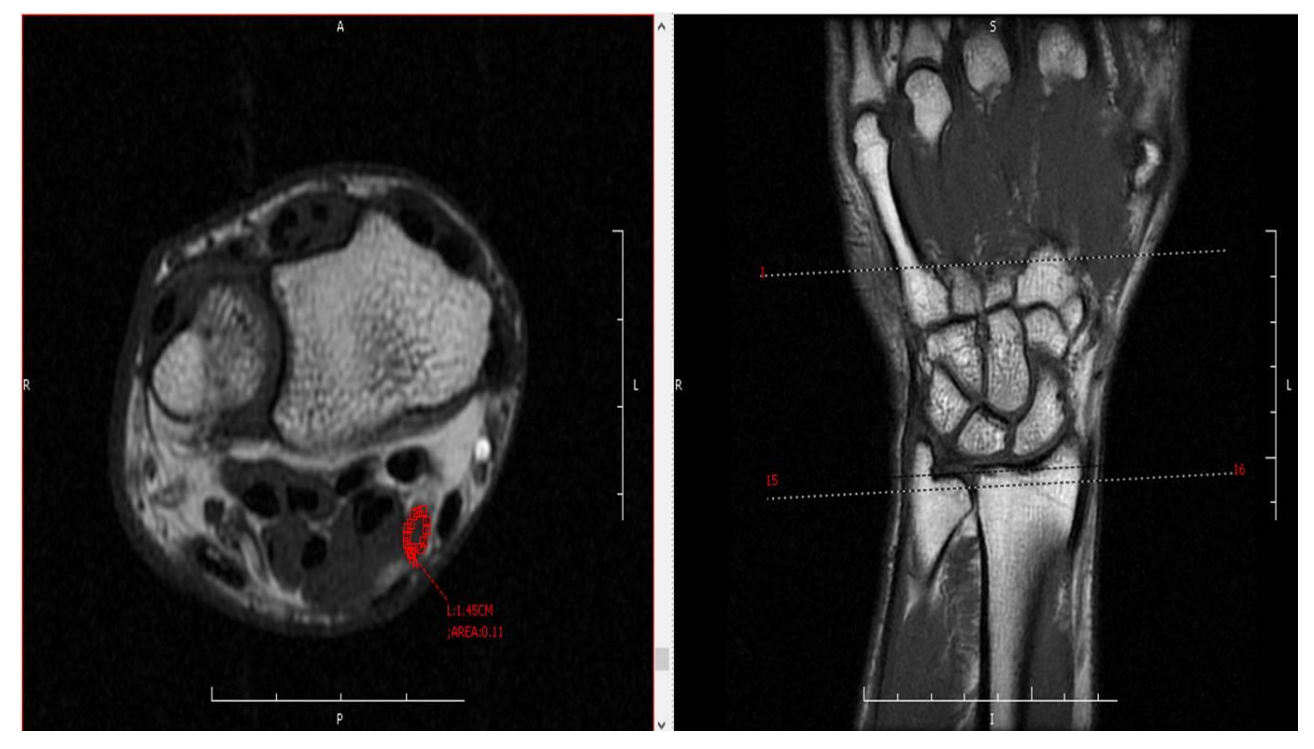
Figure 1: T1A.S. Coronal and axial section, entrance of the canal.

independent radiologists, using images obtained at the workstation. A single measurement was made for each level. The measurements were made on the T1WI. In our study, the margins of the median nerve were visualized more clearly on the T1WI, and therefore T1WIs were used for all measurements. At the workstation, the T1WI obtained in the axial plane was placed on one screen, and the image obtained in the coronal plane was placed on the other; the two screens were synchronized at the level at which the measurement would be made was marked on the image in coronal plane, and the same corresponding level in the axial plane was used for measurement in this plane. The level of radiocarpal joint was considered as the entrance level, and the plane of the hook of the hamate bone was considered as the reference for the exit level (Figures 1 and 2). The CSA measurements were made using manual tracing. The area values were expressed as 'square millimeters-mm<sup>2</sup>'.