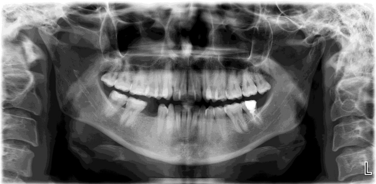
Figure 3: Multilocular PAE on the right and unilocular PAE on the left.