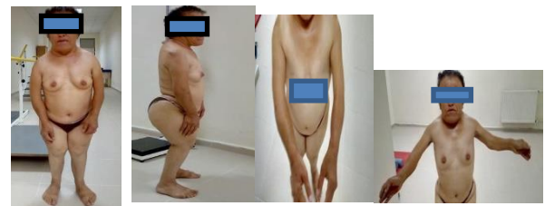
Figure 1: Phenotypic characteristics of the patient with cousin syndrome

Cervical range of motion (ROM); flexion was open, extension was 0-40°. Bilateral shoulder abduction and flexion was 0-90°, internal and external rotation was 0-45°, both elbows were ankylosed by -20°, pronation and supination movements could not be made. Wrist and finger ROM was complete. However, the patient had difficulties in activities of daily living. Lumbar movements and hip ROM were complete. Left knee flexion was 0-60°. The right knee, ankle and joint range of motion were complete. The actual leg length of the patient was measured as 57.5 cm on the right and 56 cm on the left. No abnormality was detected in the neurological examination.