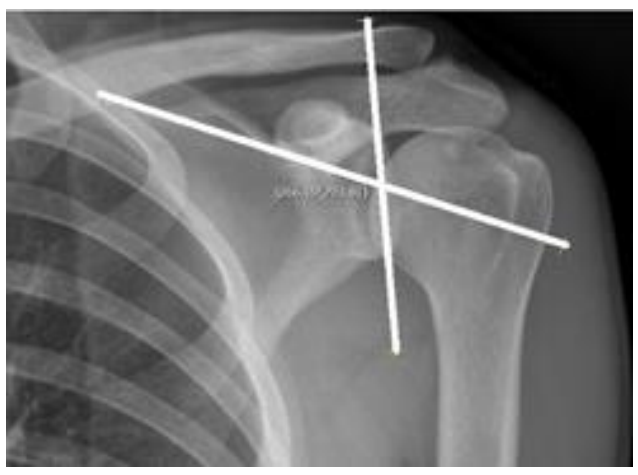
Figure 2: The acromion index (AI) was calculated by dividing the distance from the glenoid plane to the acromion by the distance from the glenoid plane to the lateral aspect of the humeral head