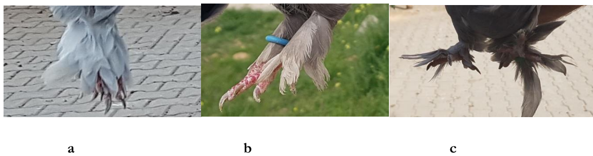
Figure 6. Fetahered feet types of the Kırıkkale tumbler pigeons a. Small muff b. Grouse c. Large muff