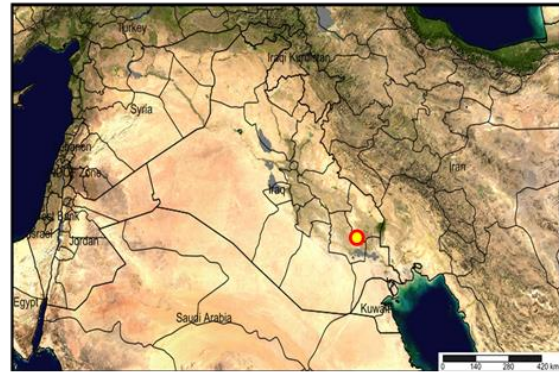
Figure 1. Map of Iraq showing specimens collection location: Thi Qar Province, Al-Gharraf city, Iraq (circle).

Specimens were collected by hand from agricultural lands, near palm trees in the city of Al-Gharraf city, north of Thi Qar Province (Fig. 1) in December 2021. The specimens were preserved in 70% ethanol and were photographed using a Nikon Z50 camera on a Krüss stereomicroscope in the Entomology Laboratory of the Biology Department, College of Science, University of Basrah. The identification was done according to Cooke (1964); Platnick and Baehr (2006); Ferrández and Carrillo (2018). Measurements are given for the segments of the legs (femur, patella, tibia, metatarsus, tarsus) and all measurements are given in millimeters.