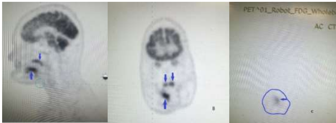
Figure 3. PET-CT showing Increased metabolic activity in the area of the soft palate, the laryngopharynx, the right half of the floor of the oral cavity ( 3A, 3B) and a cervical lymph node on the left (3C)