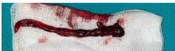
Figure 4. Thrombendarterectomy evacuated cast-like thrombus