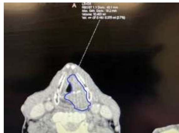
Figure 2. Computed tomography showing soft tissue lesion involving the left vocal fold, left thyroid cartilage, left aryepiglottic fold, left pharyngeal wall, and left partial epiglottis

Subsequent the positron emission computed tomography (PET-CT) showed an increased metabolic activity was visualized in the area of the soft palate, the laryngopharynx, the right half of the floor of the oral cavity (Fig. 3A, Fig. 3B) and a cervical lymph node on the left (Fig. 3C).