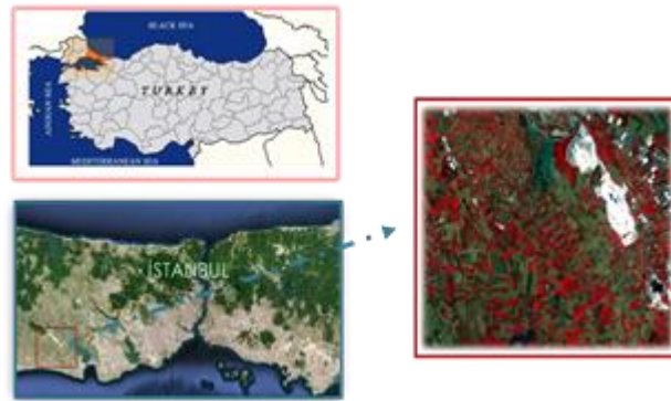
Figure 1. Study Area (İstanbul/Çatalca Test Site)

In this study, one heterogeneous test region was selected from the European side of the Istanbul. The region includes one of the valuable agricultural areas of mega city İstanbul. Çatalca test site covers the land cover categories of water surfaces, green area, bare lands, agricultural fields, mining areas, road, and artificial surfaces. Figure 2 shows three field study photos that belong to agricultural field samples in the region (From July, 2018).