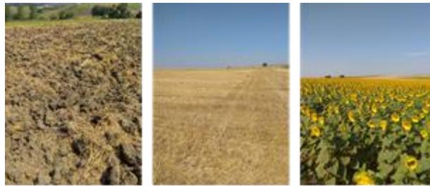
Figure 2. Agricultural fields A) ploughed B) harvested C) cultivated (sun flower)

In this study, one heterogeneous test region was selected from the European side of the Istanbul. The region includes one of the valuable agricultural areas of mega city İstanbul. Çatalca test site covers the land cover categories of water surfaces, green area, bare lands, agricultural fields, mining areas, road, and artificial surfaces. Figure 2 shows three field study photos that belong to agricultural field samples in the region (From July, 2018).