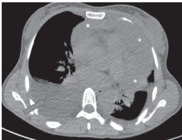
Figure 2. CT image showing pericardial (*) and pleural effusions (arrow).