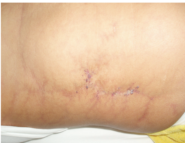
Figure 3. Abdominal skin defect.

Clinically, the patient had cyanosis, clubbing, cardiomegaly, left parasternal heave, and epigastric pulsations. The first heart sound was normal, whereas the second heart sound was wide and fixed split with accentuation of the pulmonary component. Tricuspid murmurs and pulmonary regurgitation were also present. The chest examination was clear.