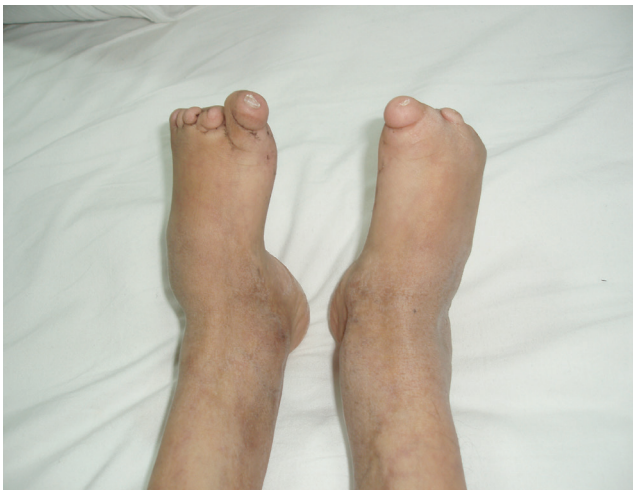
Figure 2. Asymmetric transverse limb reduction defect.