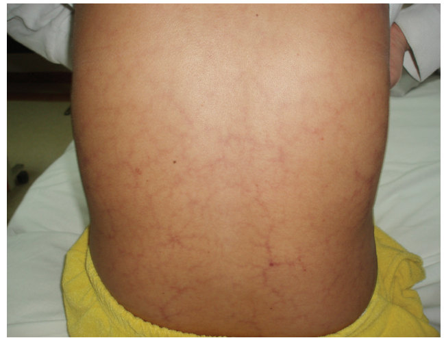
Figure 4. Abnormally dilated blood vessels.